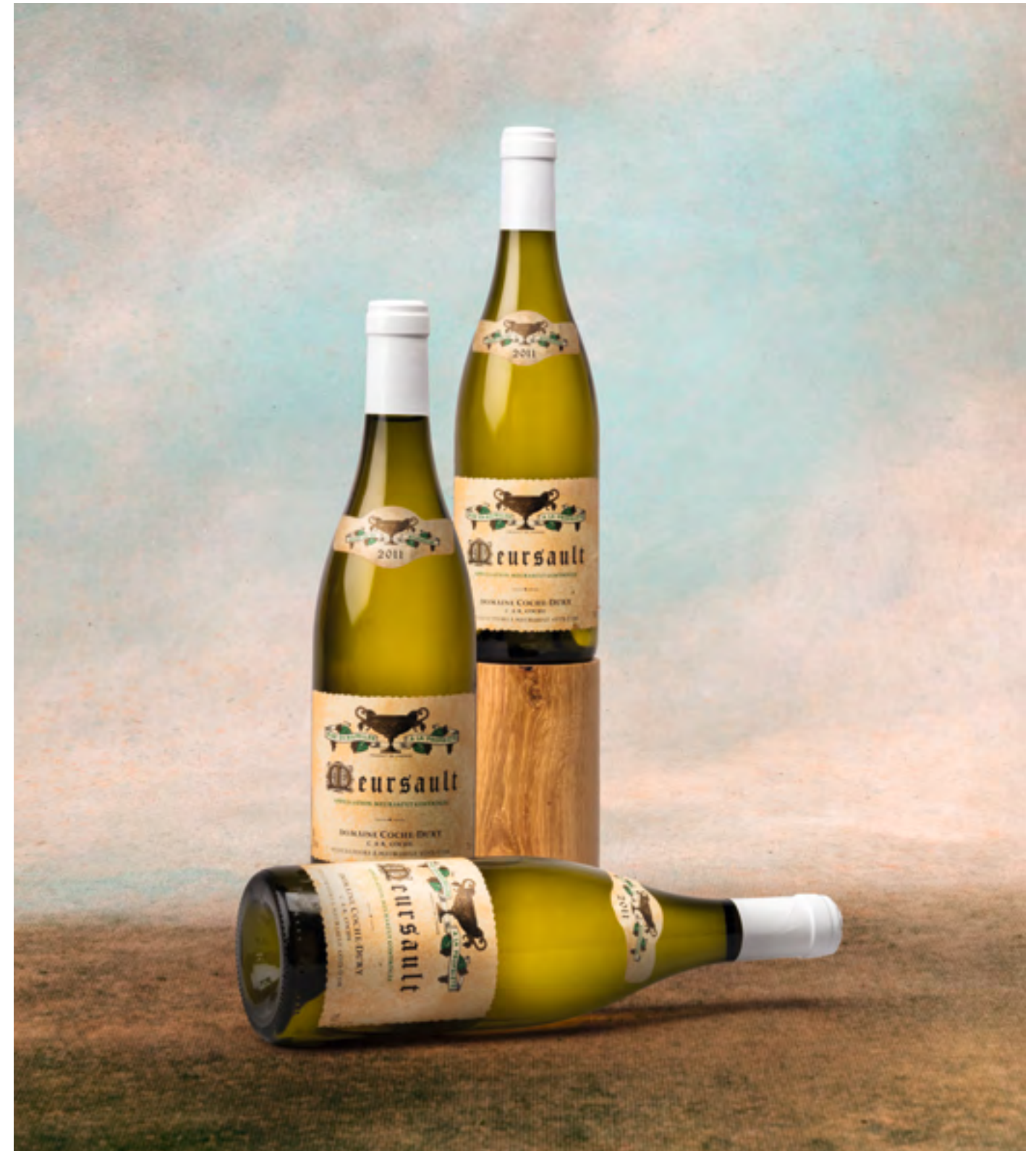
lot 447 – Domaine Coche-Dury, Meursault 2011 3 Bottles chf 2’000 – 4’000