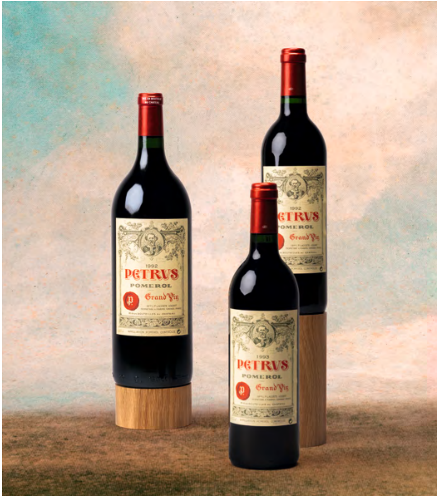
lot 176 – Petrus 1992 lot 177 – Petrus 1992 lot 178 – Petrus 1993

6 Bottles chf 6'000 – 12'000 3 Magnums chf 6'500 – 13'000 12 Bottles chf 15'000 – 30'000