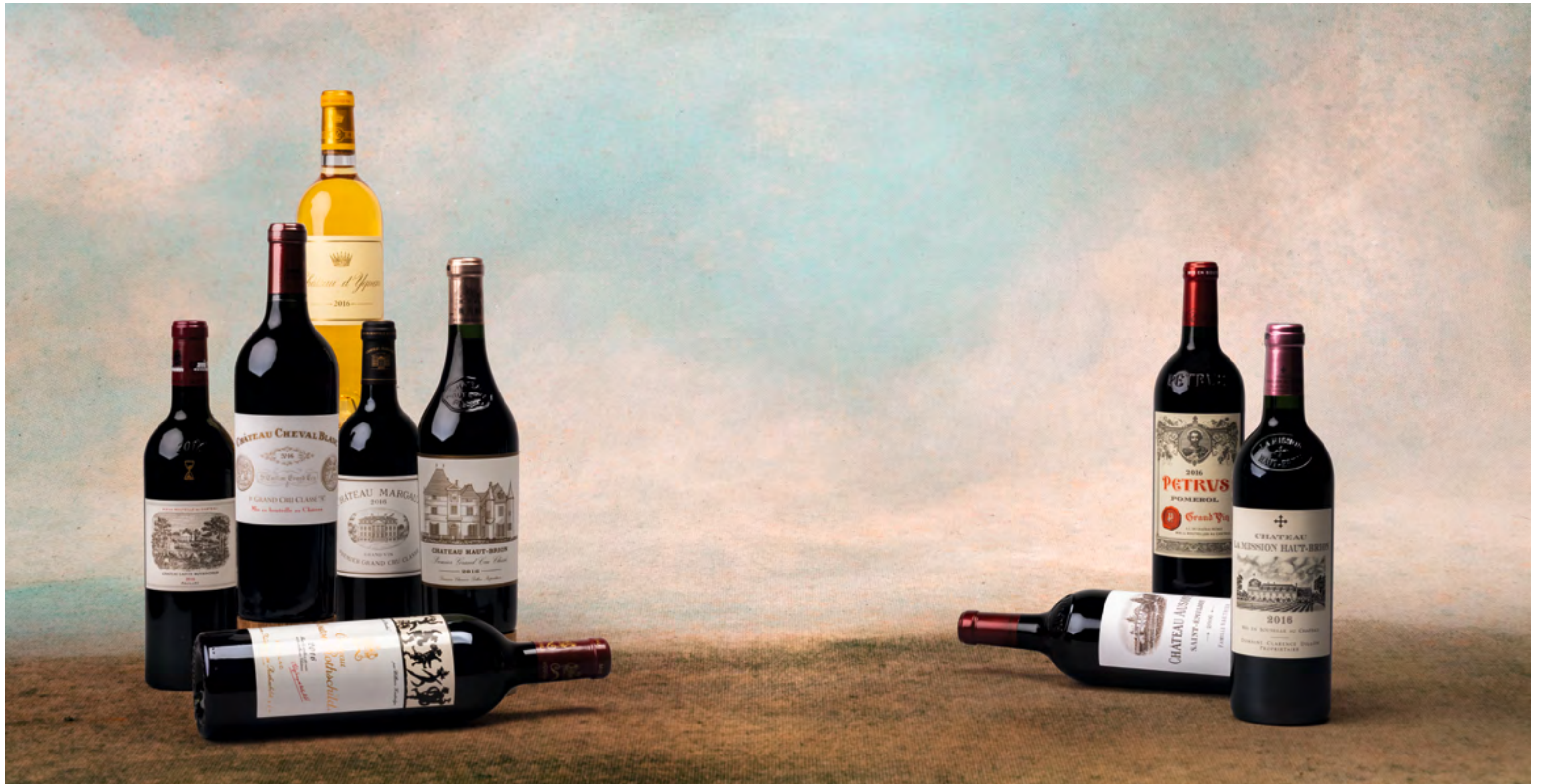
lot 387 – Caisse Collection “Duclot” 2016