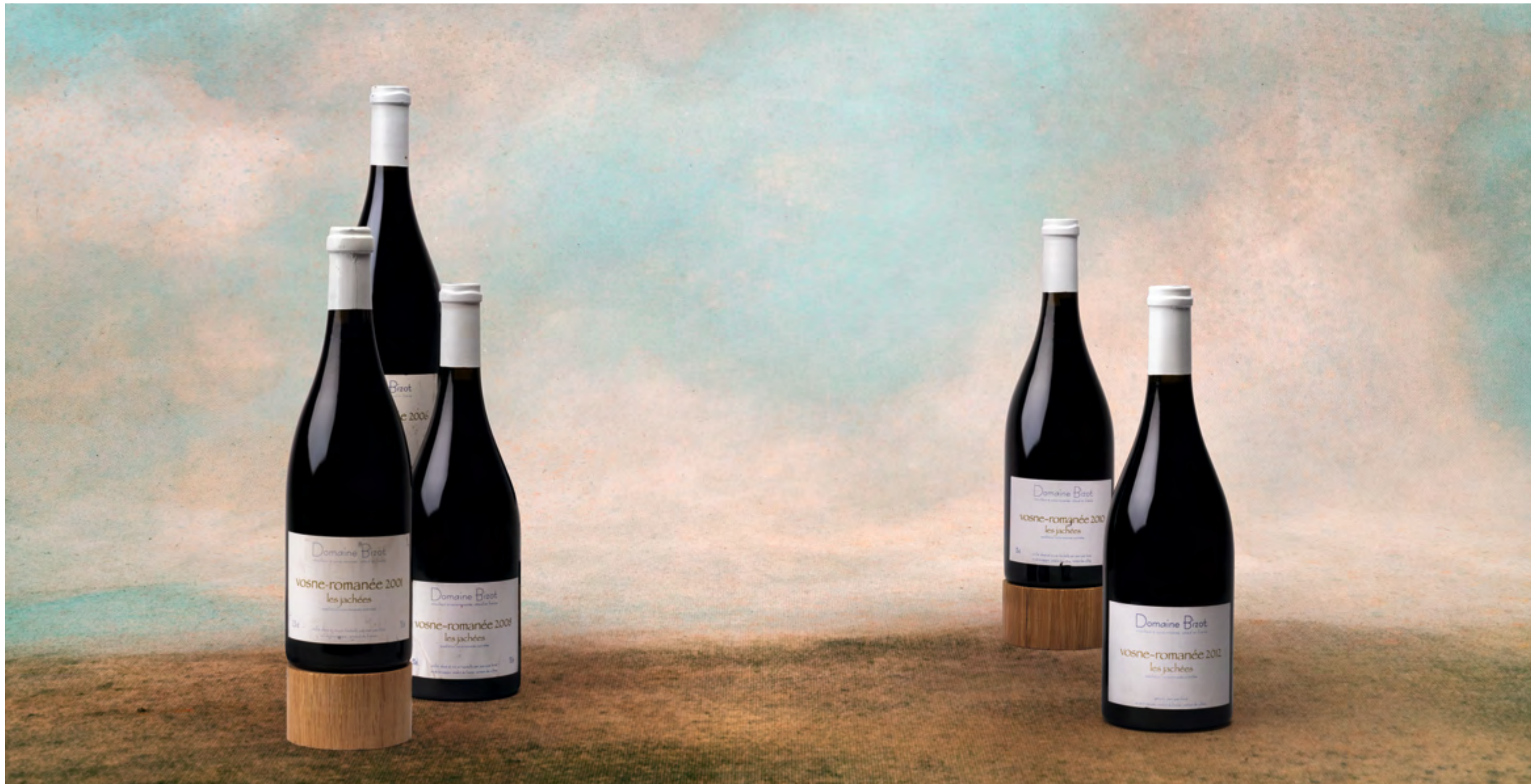
lot 505 – Domaine Bizot Mixed “ Les Jachées ” Vosne-Romanée “ Les Jachées ” 2001 Vosne-Romanée “ Les Jachées ” 2006 Vosne-Romanée “ Les Jachées ” 2010 Vosne-Romanée “ Les Jachées ” 2012