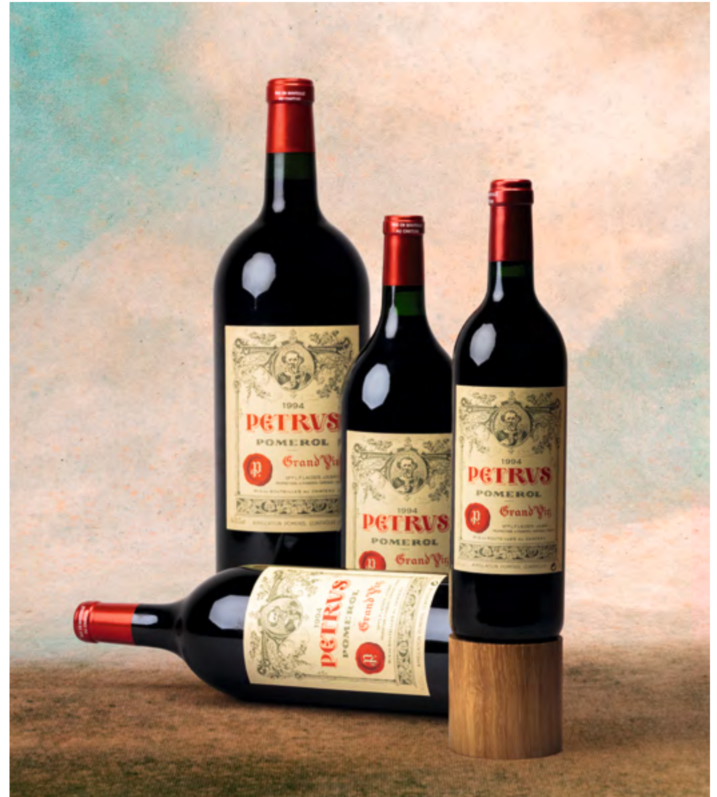
lot 179 – Petrus 1994 lot 180 – Petrus 1994 lot 181 – Petrus 1994 lot 182 – Petrus 1994

6 Bottles chf 6'000 – 12'000 3 Magnums chf 6'500 – 13'000 12 Bottles chf 15'000 – 30'000