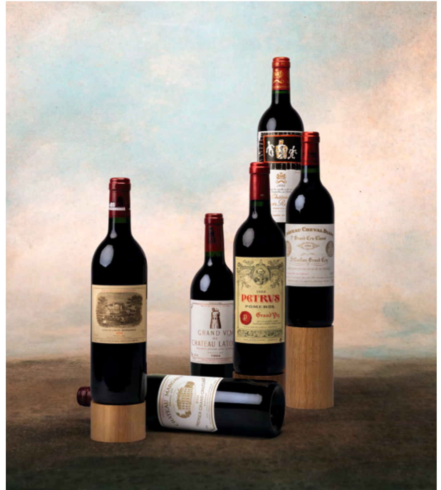
lot 394 – Caisse Prestige “Bordeaux Primeurs” 1994