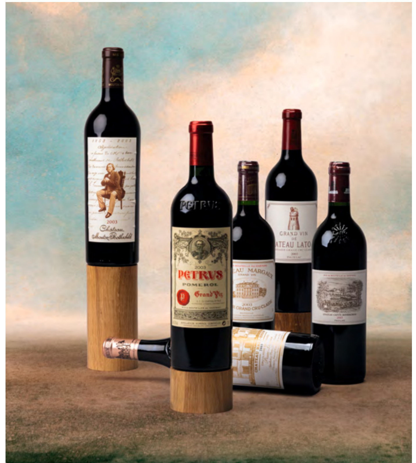
lot 404 – Caisse Prestige “Bordeaux Primeurs” 2003 6 Bottles chf 4'000 – 8'000 lot 405 – Caisse Prestige “Bordeaux Primeurs” 2003 6 Bottles chf 4'000 – 8'000 lot 406 – Caisse Prestige “Bordeaux Primeurs” 2003 6 Bottles chf 4'000 – 8'000