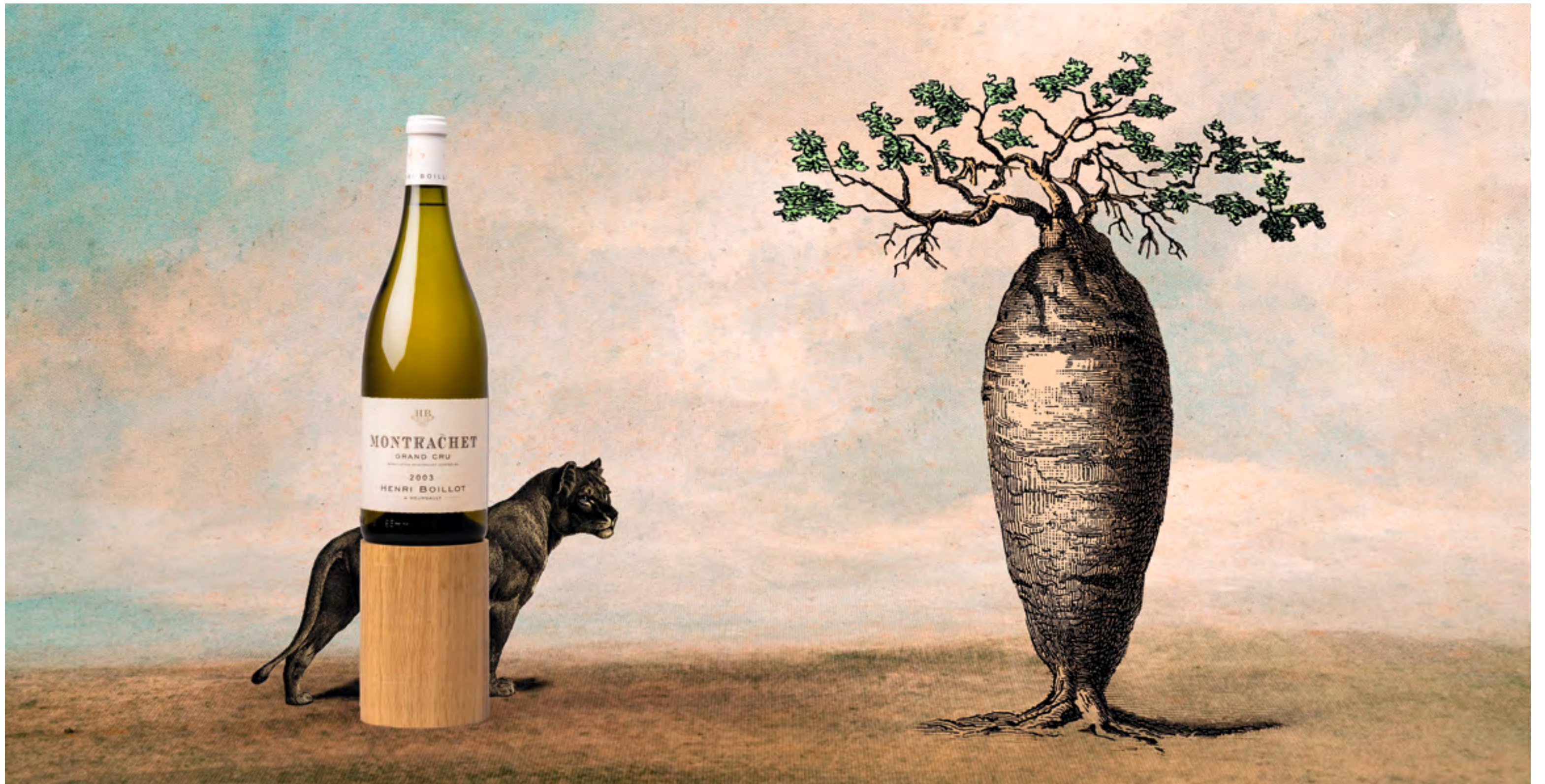
lot 451 – Domaine Henri Boillot, Montrachet 2003