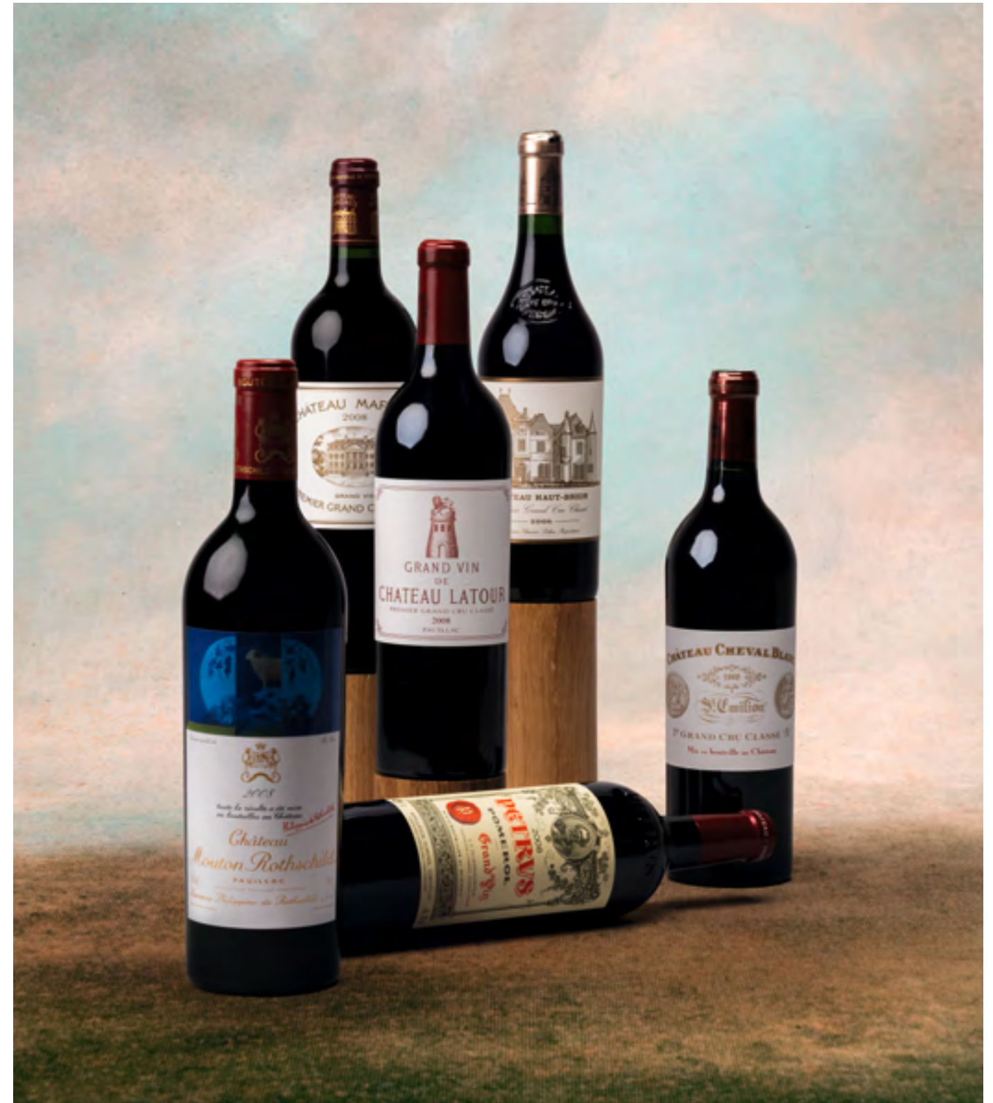
lot 408 – Caisse Prestige “Bordeaux Primeurs” 2008