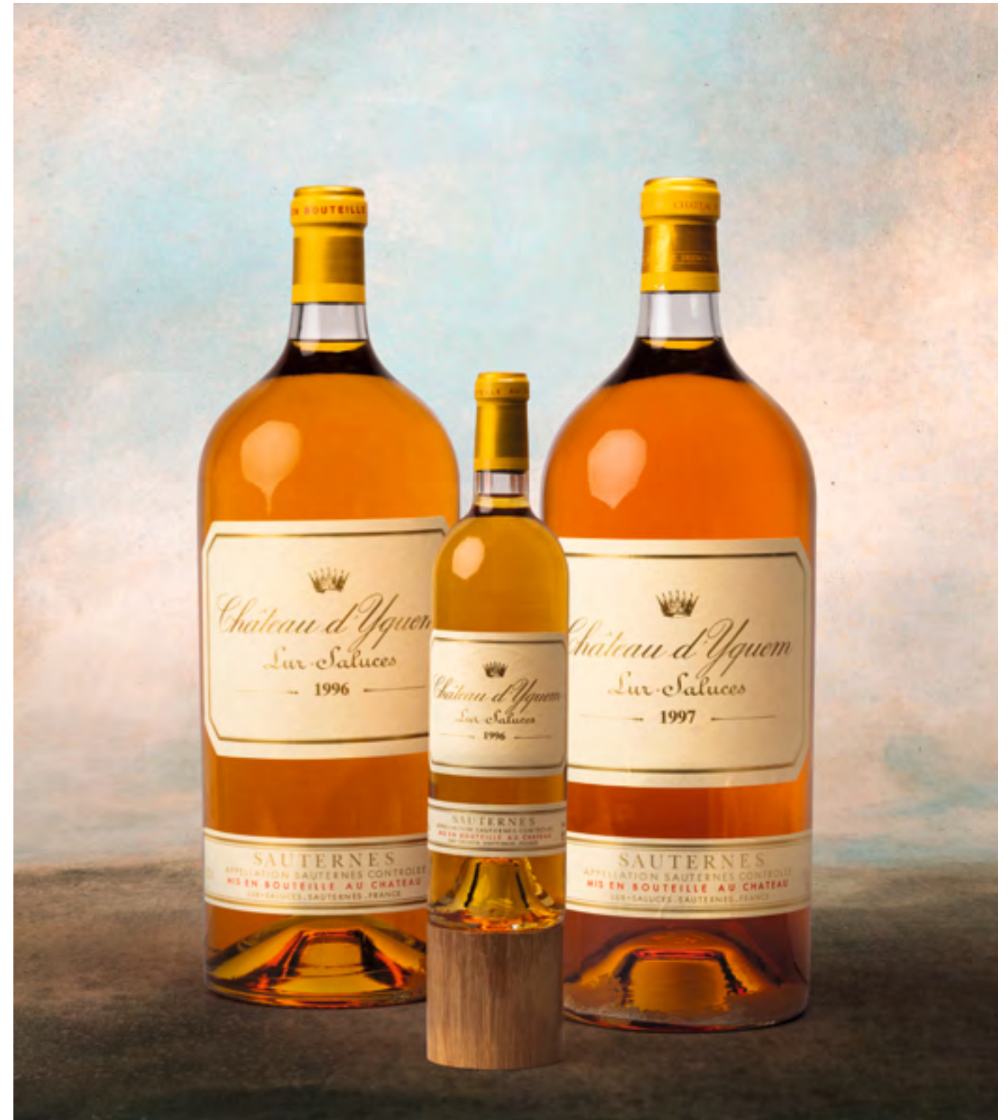
lot 371 – Château d'Yquem 1996 lot 372 – Château d'Yquem 1996 lot 373 – Château d'Yquem 1997 lot 374 – Château d'Yquem 1997

1 Imperial chf 1'600 – 3'200 6 Bottles chf 1'000 – 2'000 1 Imperial chf 1'400 – 2'800