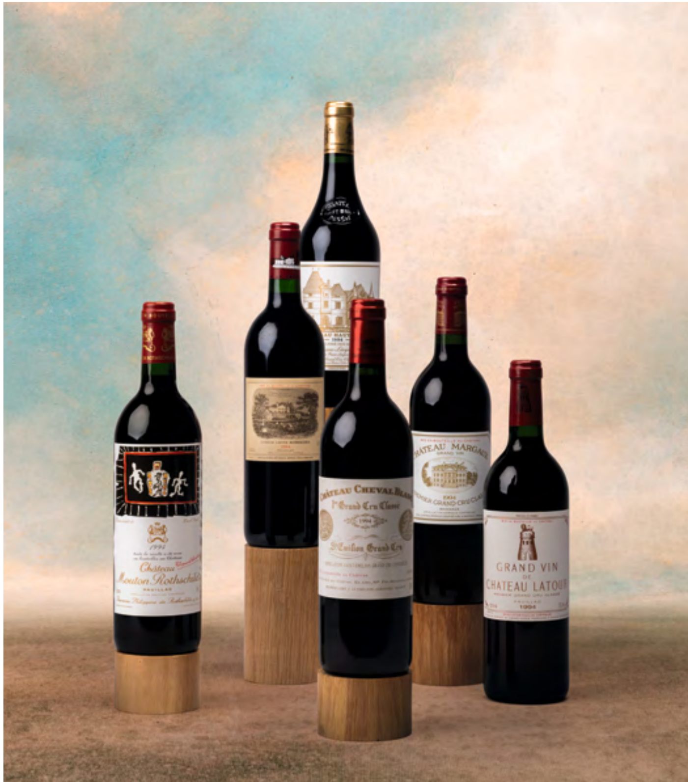
lot 393 – Premiers Crus Classés 1994