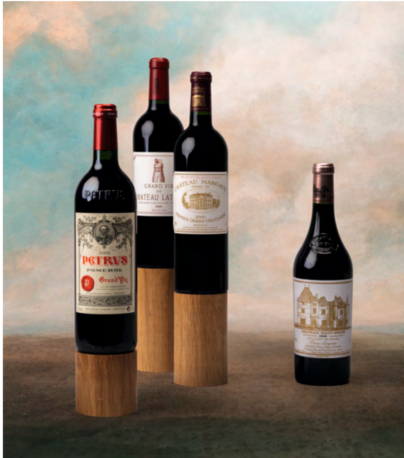
lot 410 – “Bordeaux Primeurs” 2000