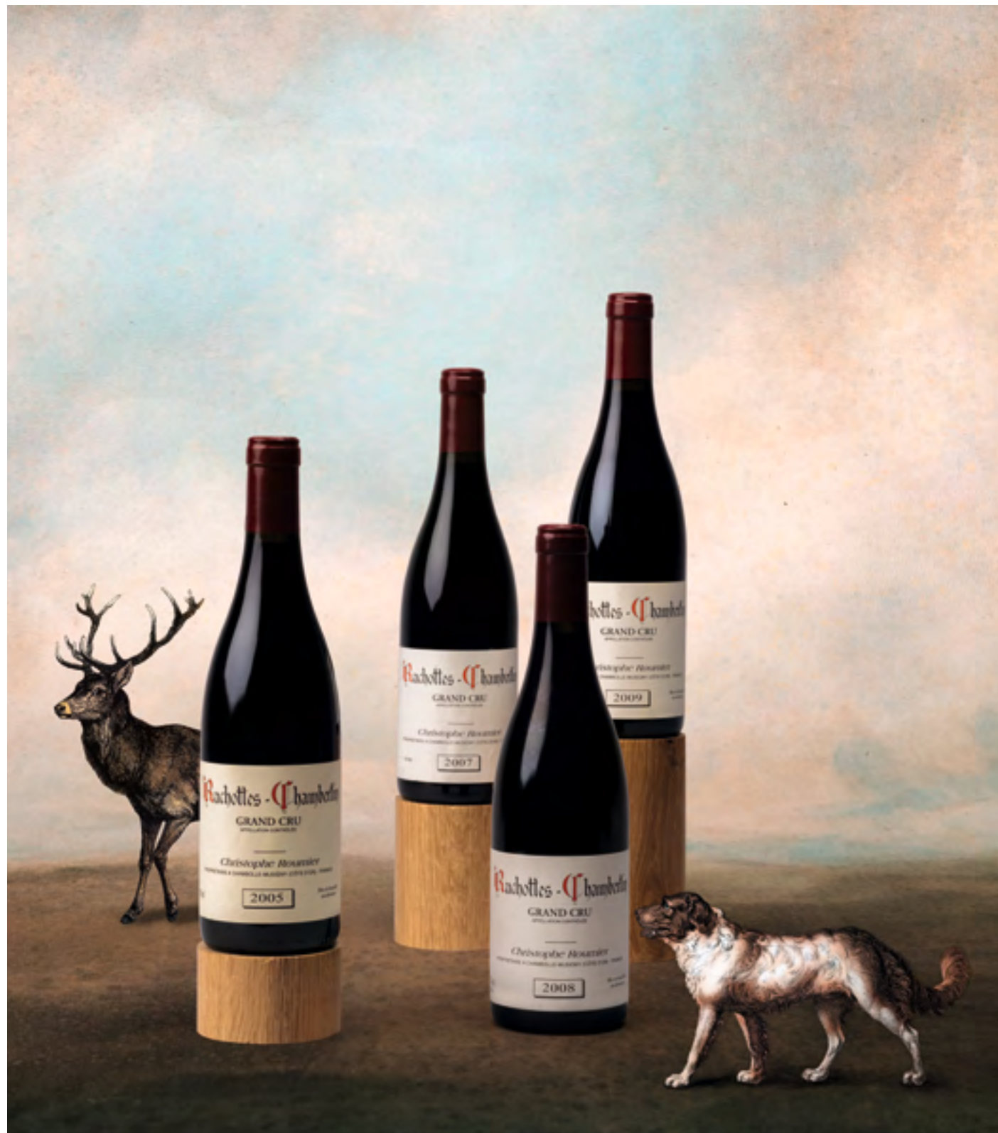
lot 474 – Domaine Christophe Roumier Mixed Ruchottes-Chambertin chf 2'400 – 4'800 Ruchottes-Chambertin 2005 1 Bottle Ruchottes-Chambertin 2007 1 Bottle Ruchottes-Chambertin 2008 1 Bottle lot 475 – Domaine Christophe Roumier, Ruchottes-Chambertin 2009 3 Bottles chf 2'400 – 4'800