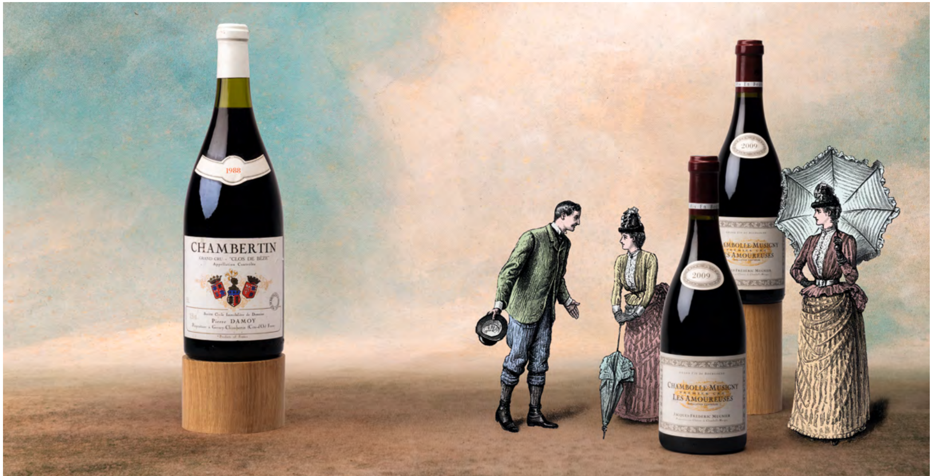
lot 520 – Domaine Pierre Damoy, Chambertin Clos de Bèze 1988 1 Magnum chf 400 – 800