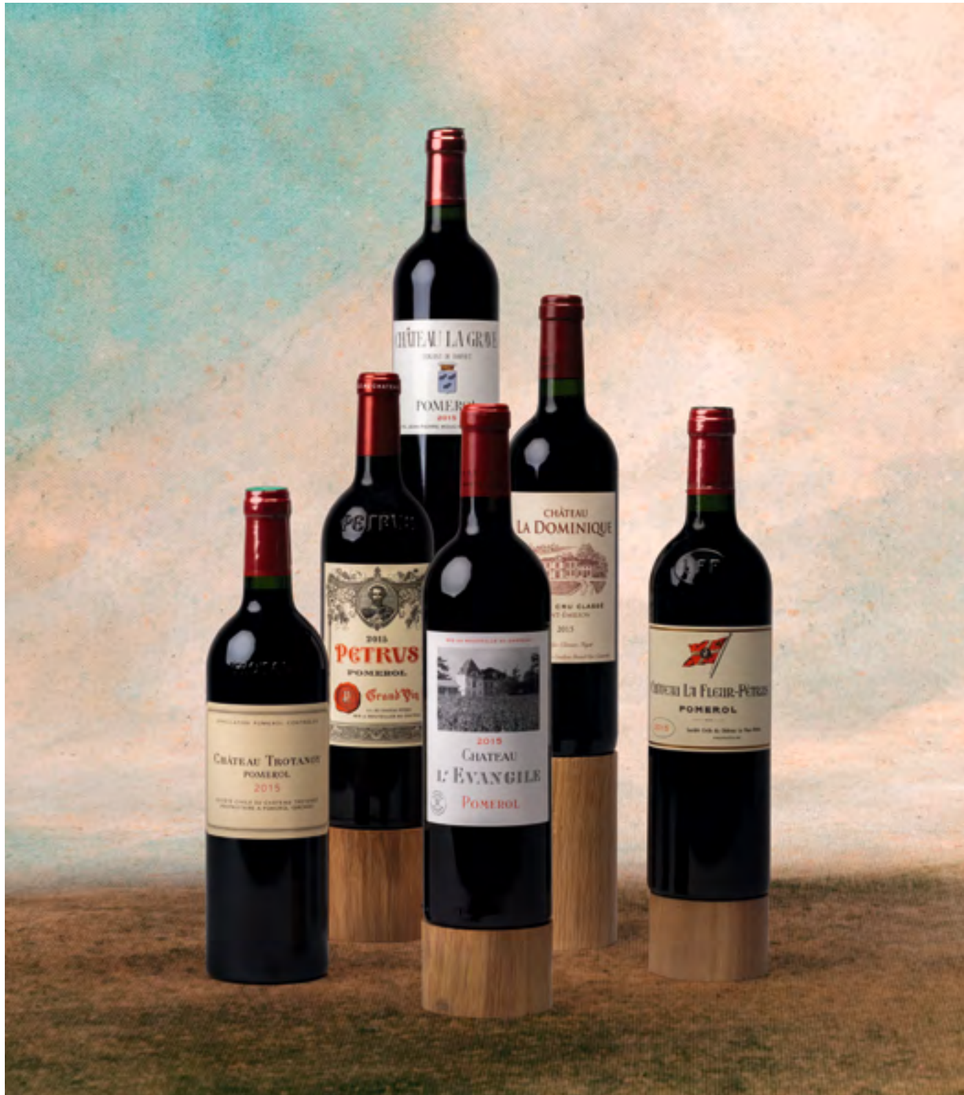
lot 392 – Caisse “Bordeaux Rive Droite” 2015