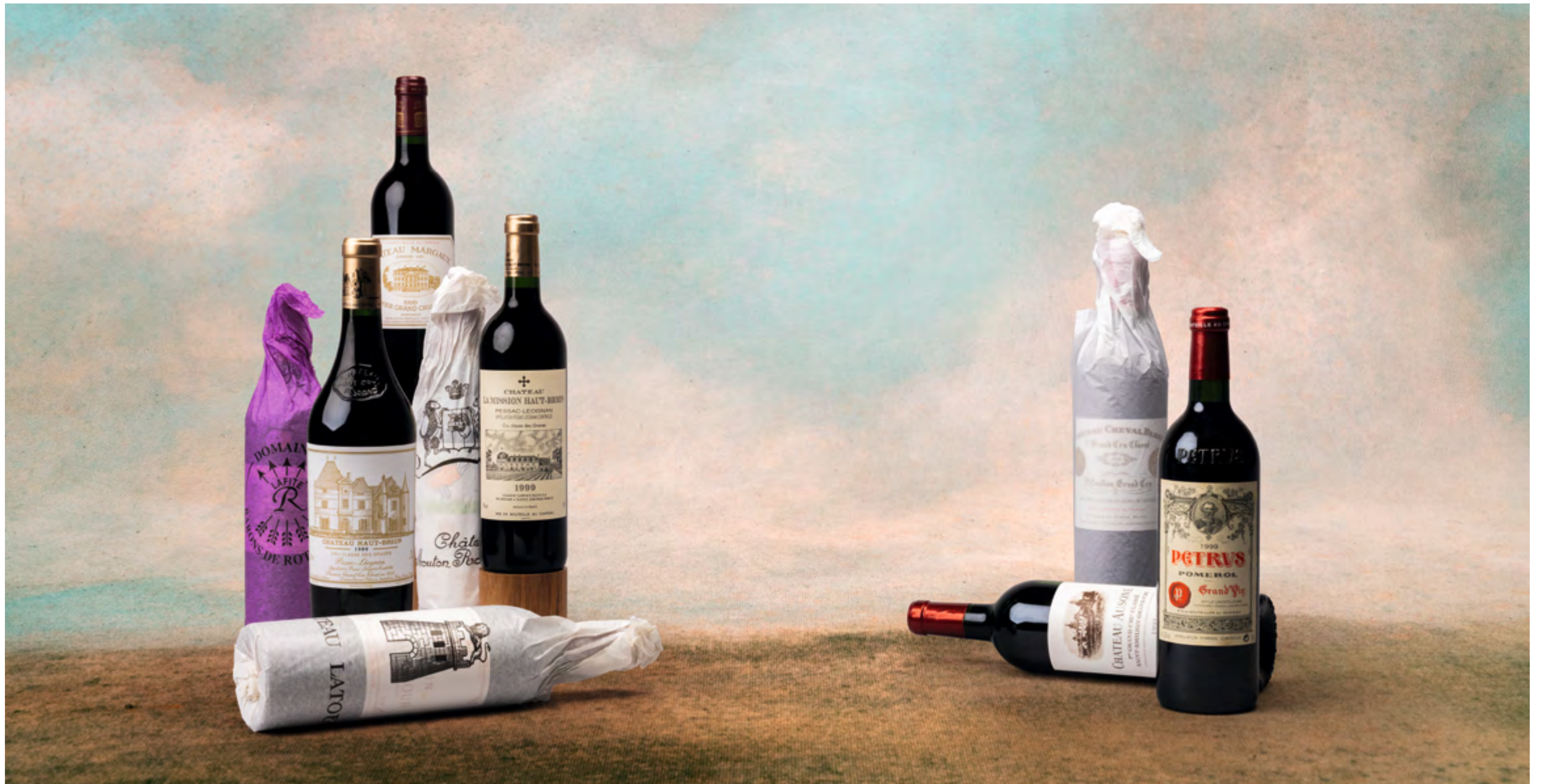
lot 375 – Caisse Collection “Duclot” 1999