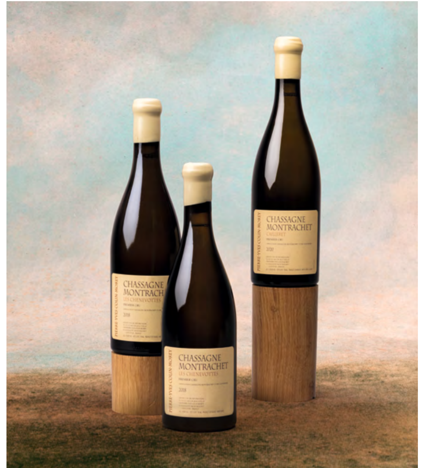
lot 420 – Domaine P.Y Colin-Morey

Chassagne-Montrachet “ Les Caillerets ” 2020