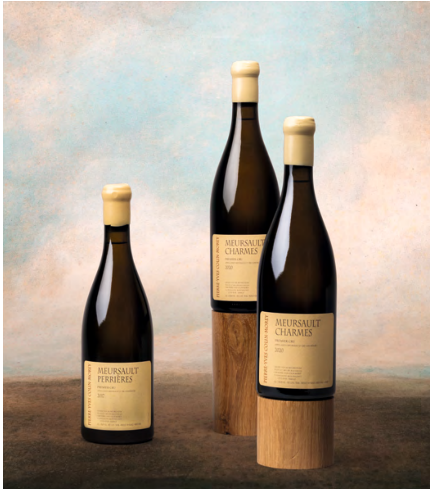
lot 418 – Domaine P.Y Colin-Morey, Meursault “ Les Perrières ” 2017