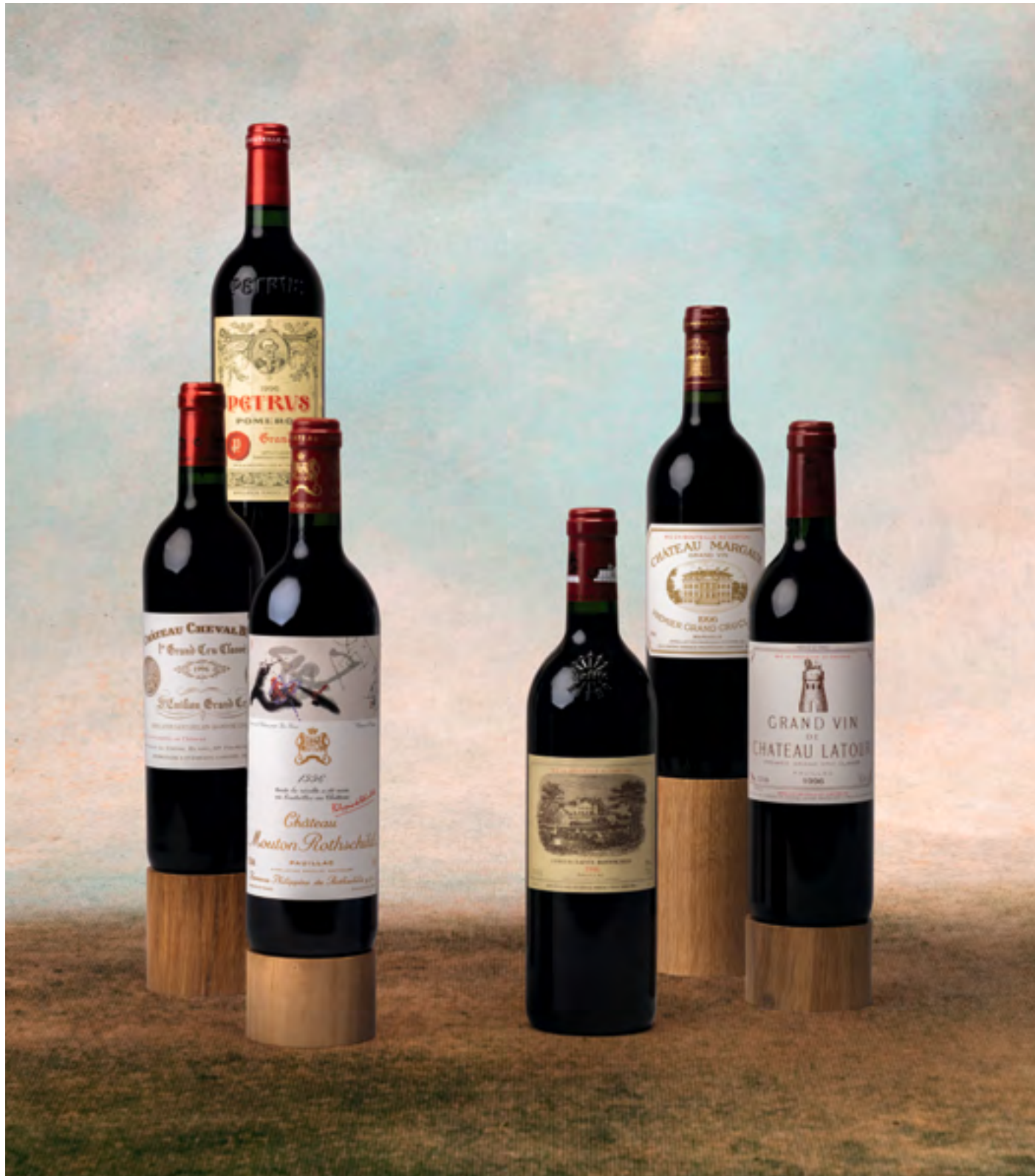
lot 396 – Caisse Prestige “Bordeaux Primeurs” 1996 12 Bottles chf 7'000 – 1'400 lot 397 – Caisse Prestige “Bordeaux Primeurs” 1996 12 Bottles chf 7'000 – 1'400 lot 398 – Caisse Prestige “Bordeaux Primeurs” 1996 12 Bottles chf 7'000 – 1'400 lot 399 – Caisse Prestige “Bordeaux Primeurs” 1996 12 Bottles chf 7'000 – 1'400