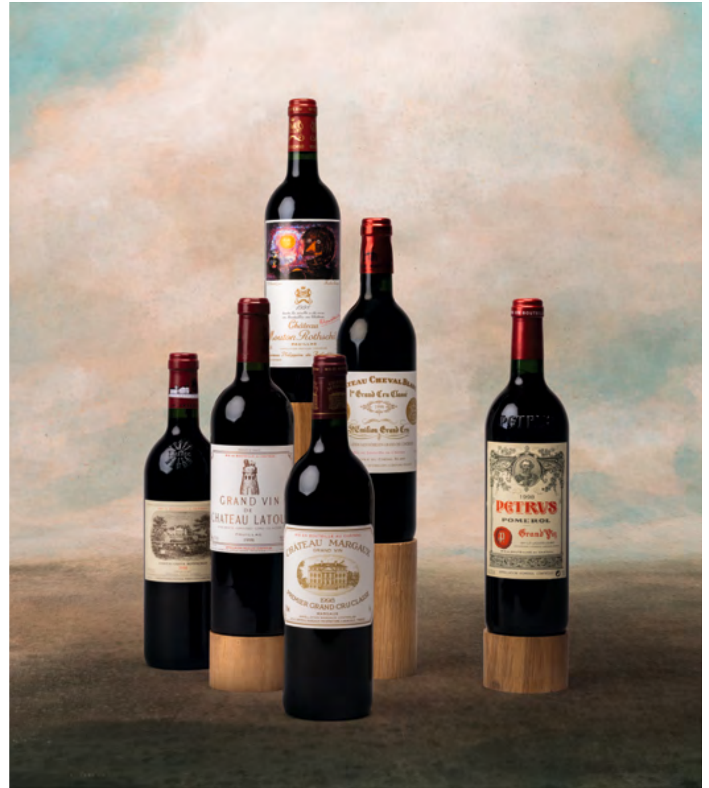
lot 400 – Caisse Prestige “Bordeaux Primeurs” 1998 12 Bottles chf 7'500 – 15'000