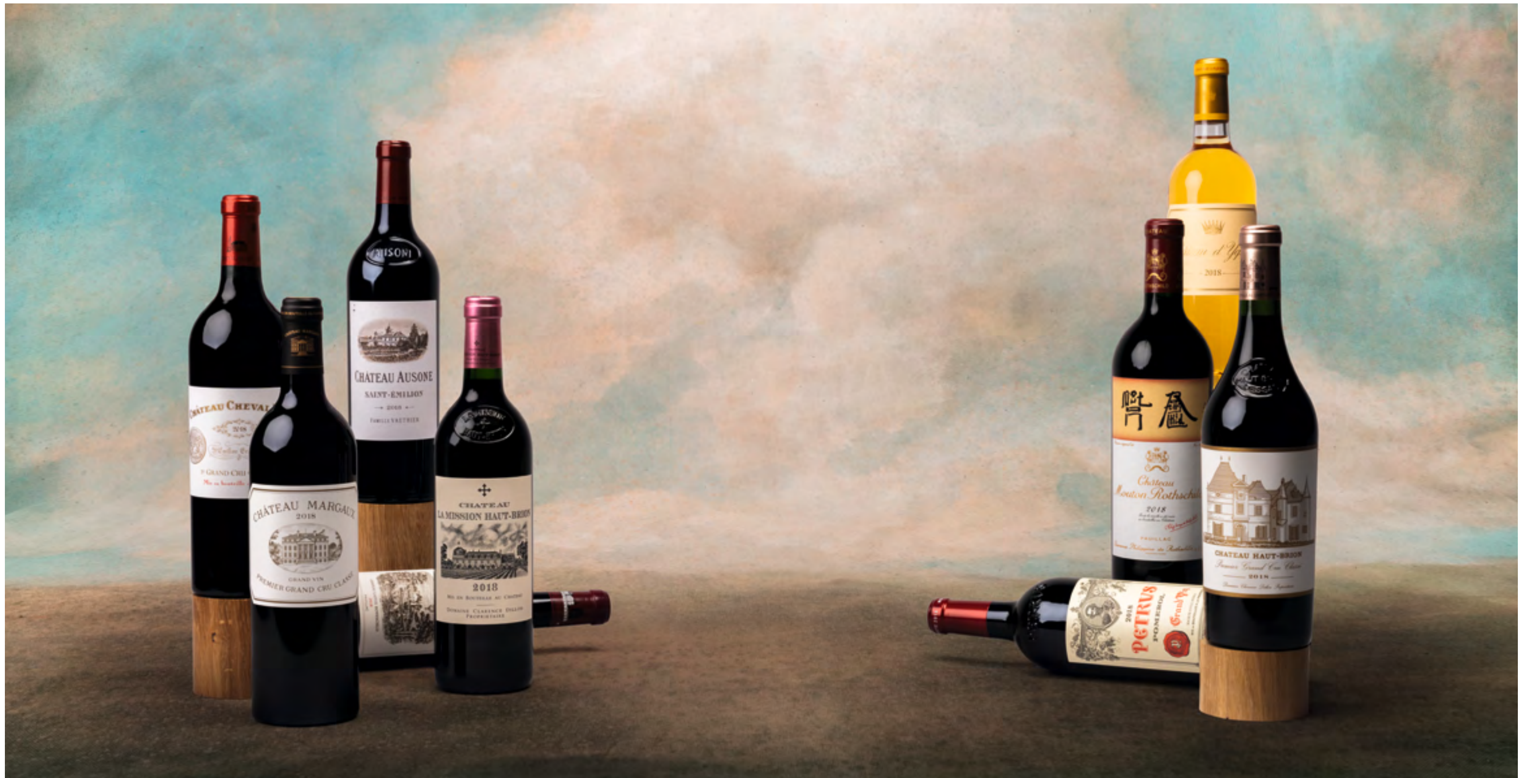
lot 388 – Caisse Collection “Duclot” 2018