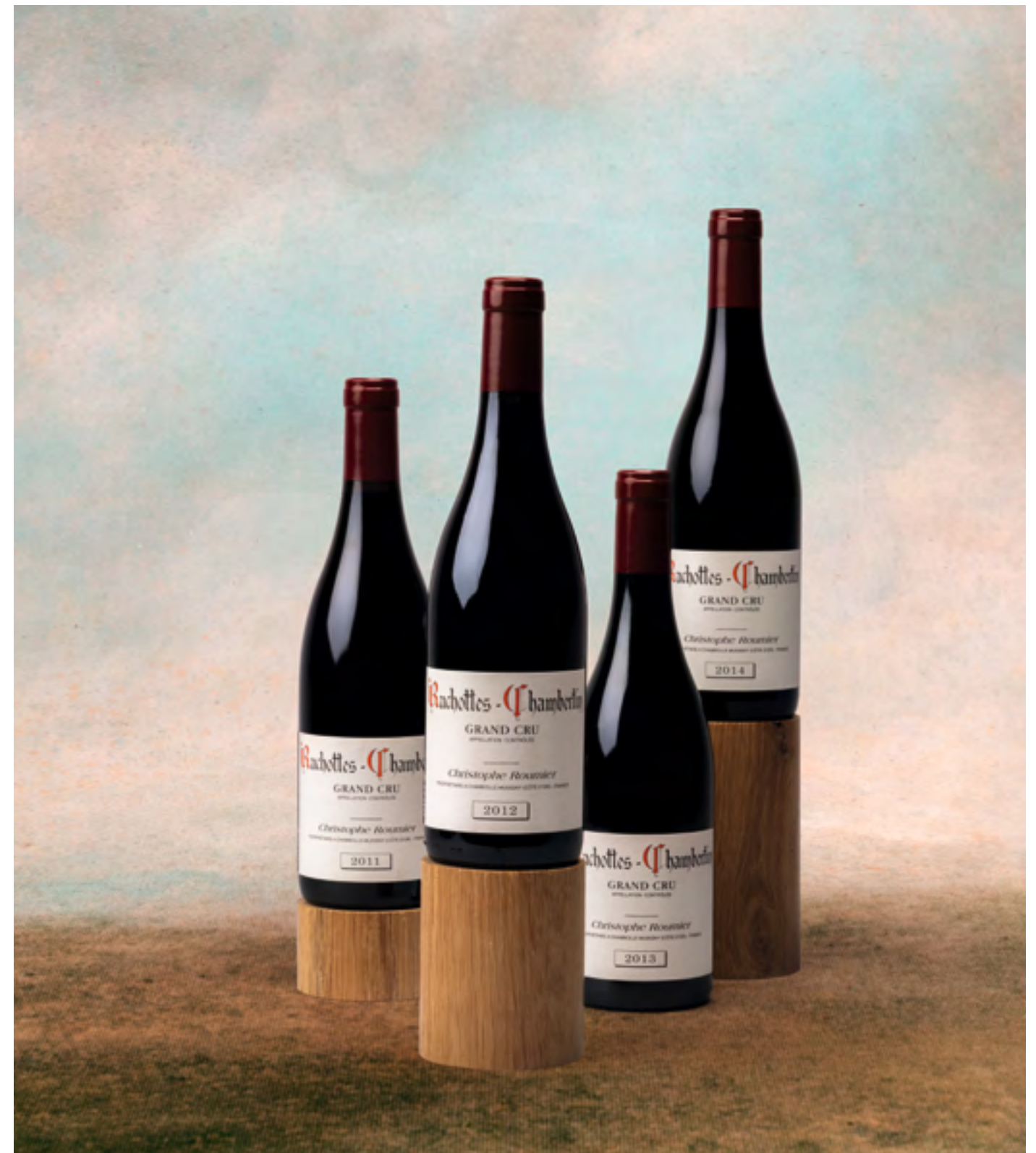
lot 476 – Domaine Christophe Roumier chf 2'600 – 5'200 Ruchottes-Chambertin 2011 1 Bottle Ruchottes-Chambertin 2012 1 Bottle Ruchottes-Chambertin 2013 1 Bottle Ruchottes-Chambertin 2014 1 Bottle