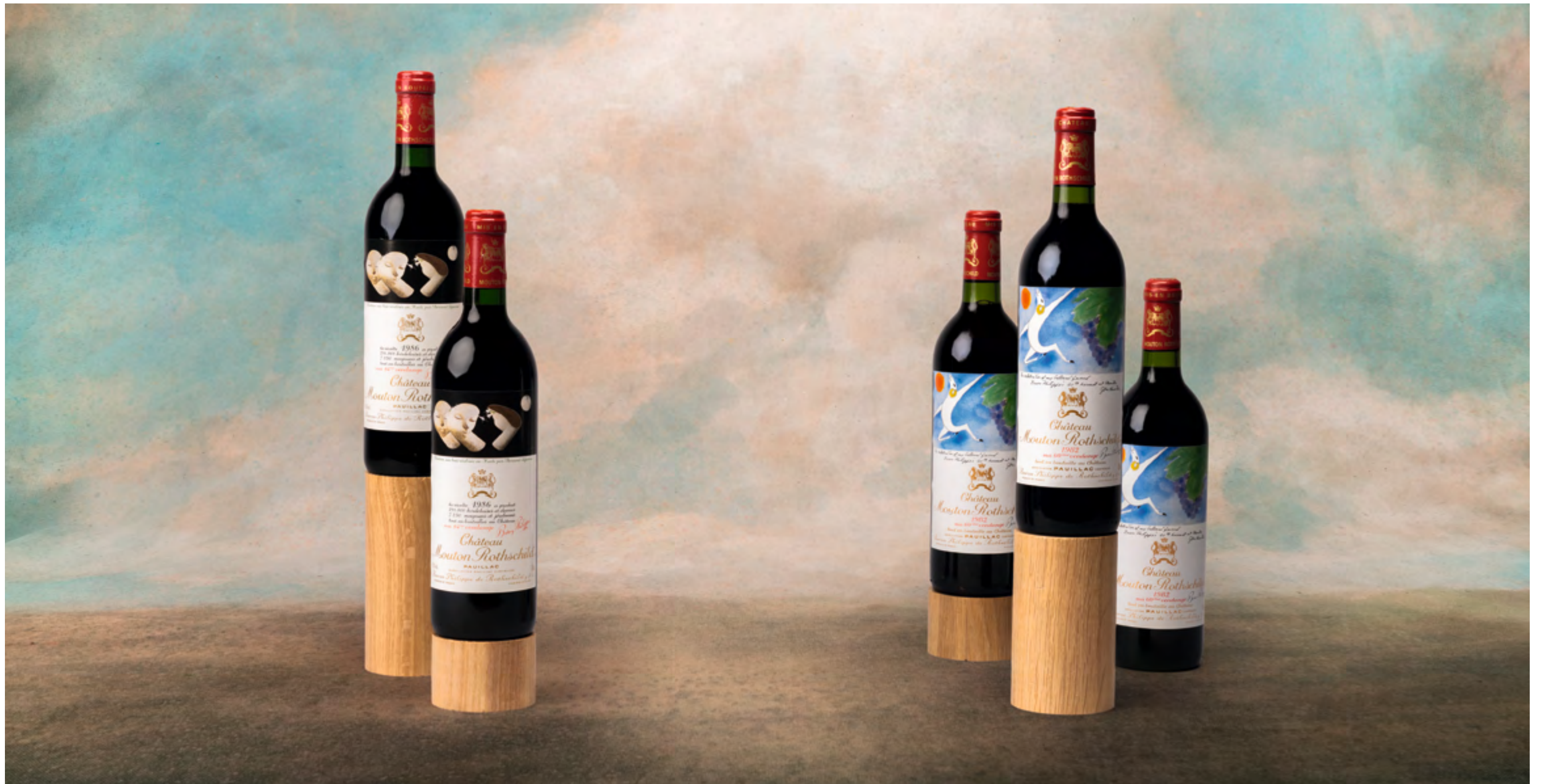
lot 50 – Château Mouton-Rothschild 1982 lot 51 – Château Mouton-Rothschild 1986

12 Bottles CHF 9'000 – 18'000 12 Bottles CHF 6'000 – 12'000