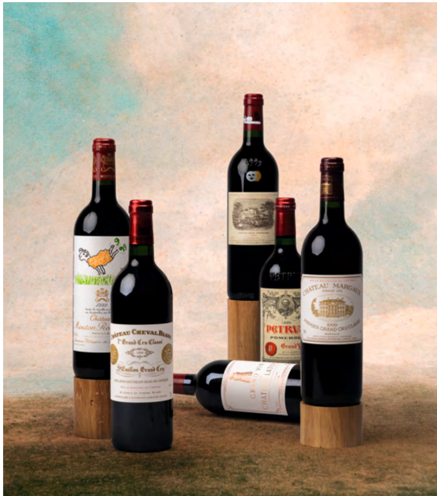
lot 401 – Caisse Prestige “Bordeaux Primeurs” 1999 12 Bottles chf 4'000 – 8'000 lot 402 – Caisse Prestige “Bordeaux Primeurs” 1999 12 Bottles chf 4'000 – 8'000 lot 403 – Caisse Prestige “Bordeaux Primeurs” 1999 12 Bottles chf 4'000 – 8'000