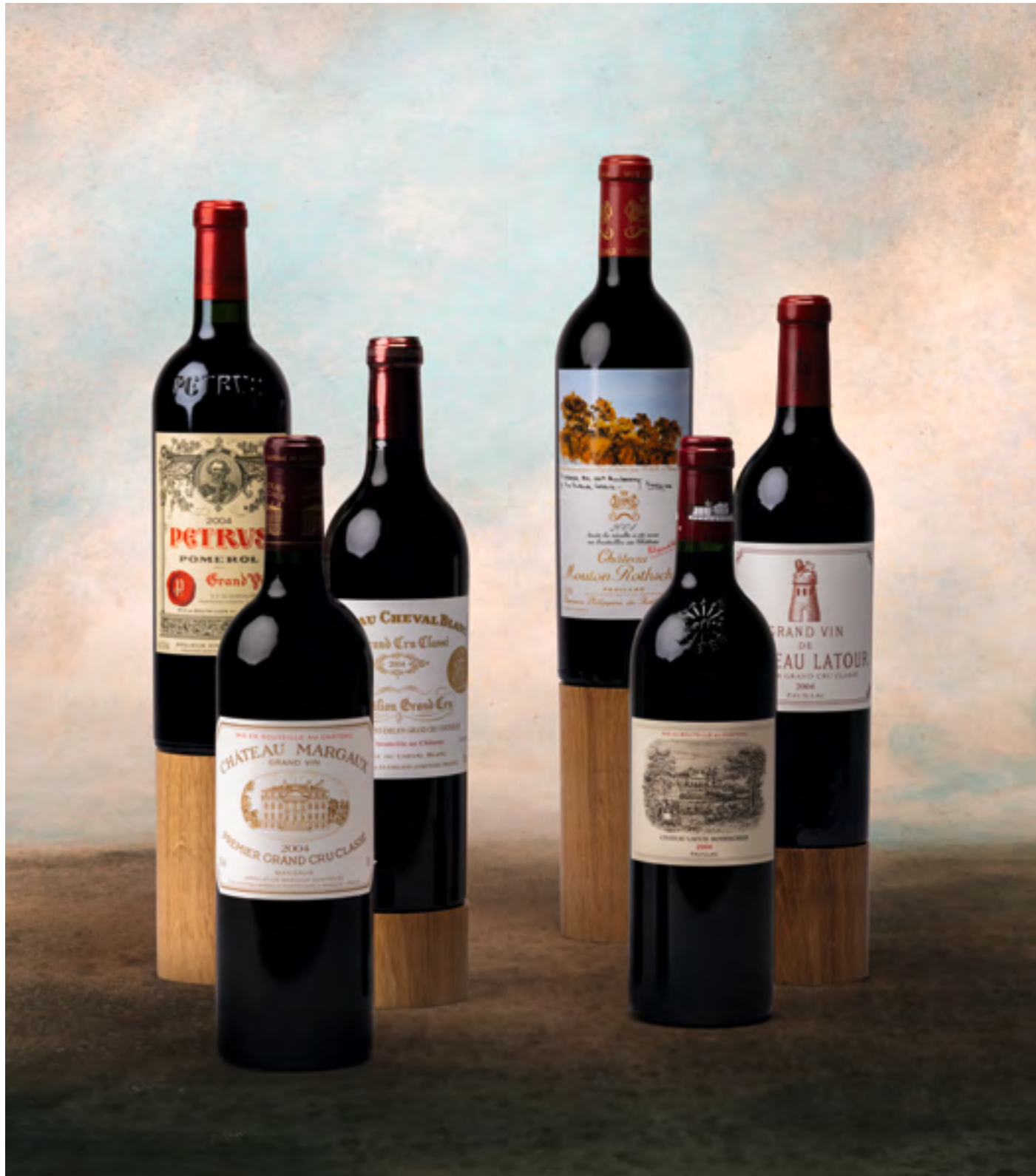
lot 407 – Caisse Prestige “Bordeaux Primeurs” 2004