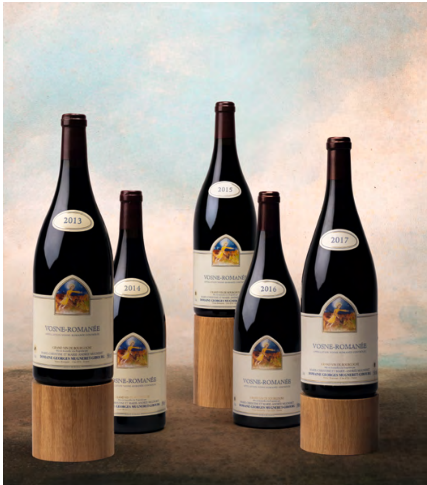
lot 493 – Domaine Mugneret-Gibourg Mixed Vosne-Romanée