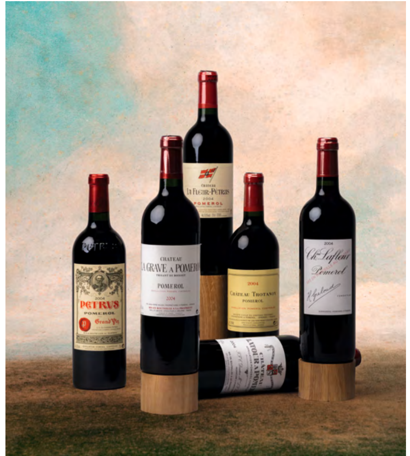
lot 389 – Caisse “Bordeaux Rive Droite” 2004