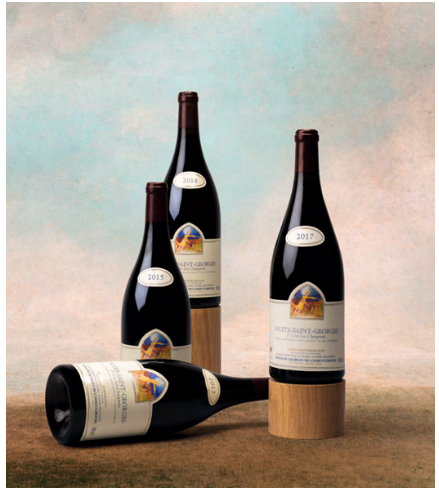
lot 494 – Domaine Mugneret-Gibourg Mixed “Les Chaignots”