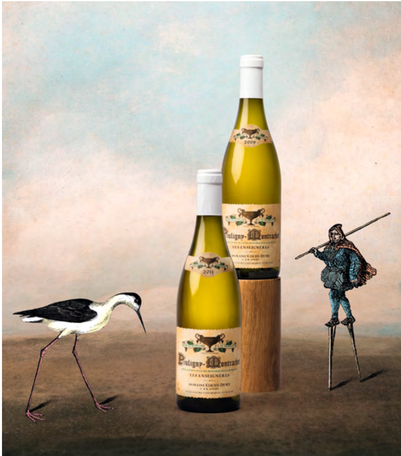
lot 445 – Domaine Coche-Dury, Puligny-Montrachet “Les Enseignères” 2009 3 Bottles chf 2’400 – 4’800 lot 446 – Domaine Coche-Dury, Puligny-Montrachet “Les Enseignères” 2011 3 Bottles chf 2’200 – 4’400