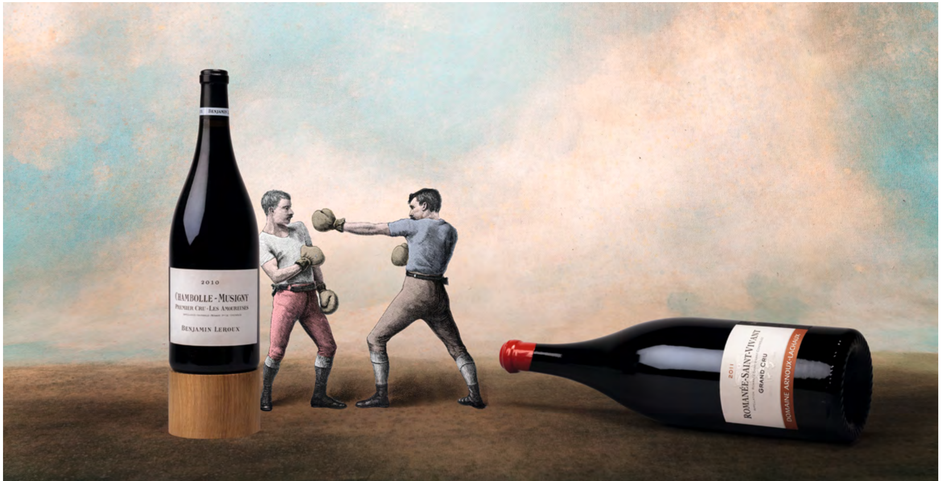
lot 522 – Domaine Benjamin Leroux Chambolle-Musigny “Les Amoureuses” 2010