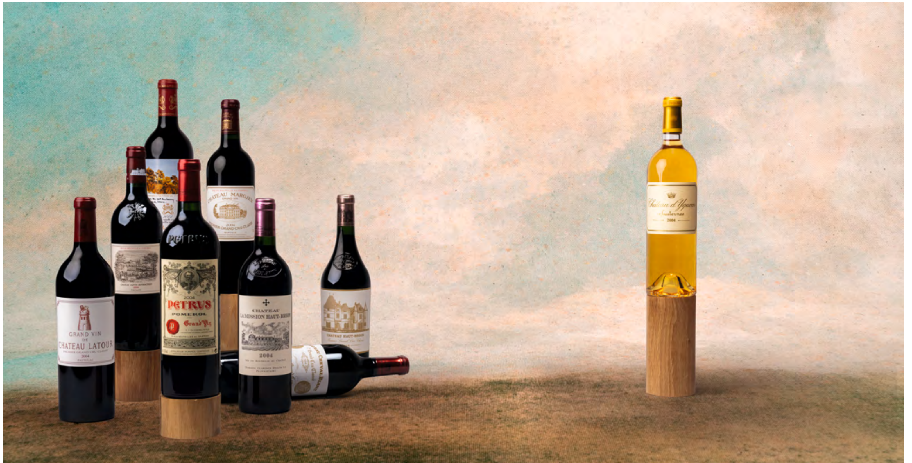
lot 379 – Caisse Collection “Duclot” 2004