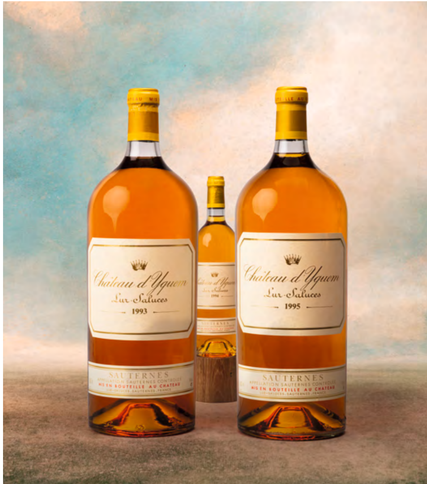
lot 368 – Château d'Yquem 1993 lot 369 – Château d'Yquem 1994 lot 370 – Château d'Yquem 1995

1 Imperial chf 1'600 – 3'200 6 Bottles chf 1'000 – 2'000 1 Imperial chf 1'400 – 2'800