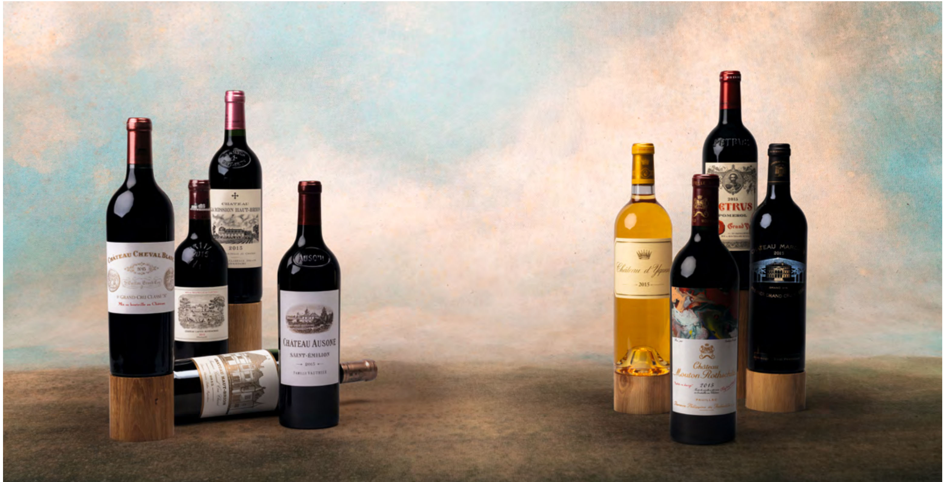
lot 386 – Caisse Collection "Duclot" 2015