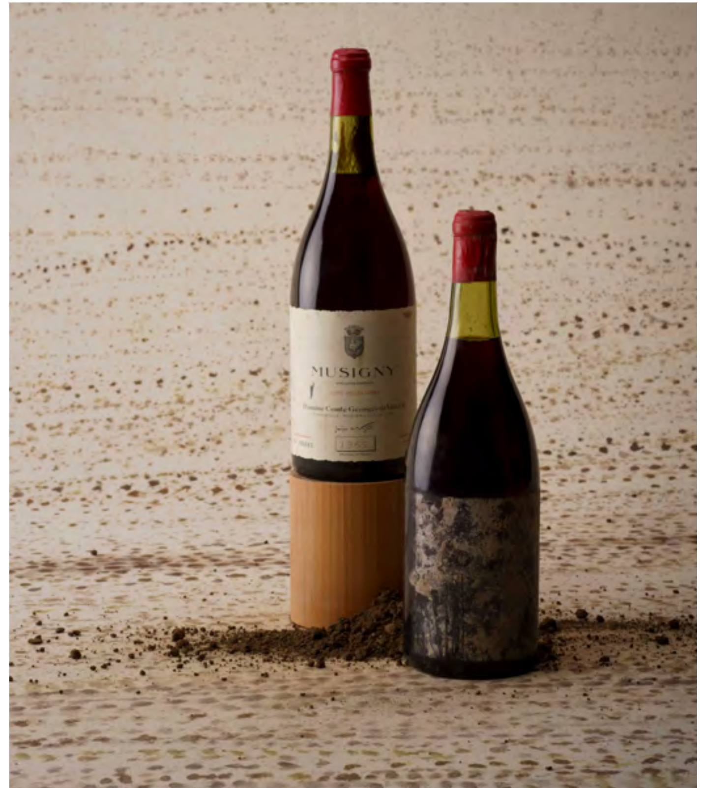
Photograph shows lot 78 – the photograph of lot 79 is available on our website

lot 79 One cut capsule to reveal branded cork Stained labels Levels: one at 7,5cms and one at 9cms below base of capsules 2 Magnums per lot CHF 3'000 – 6'000 per lot