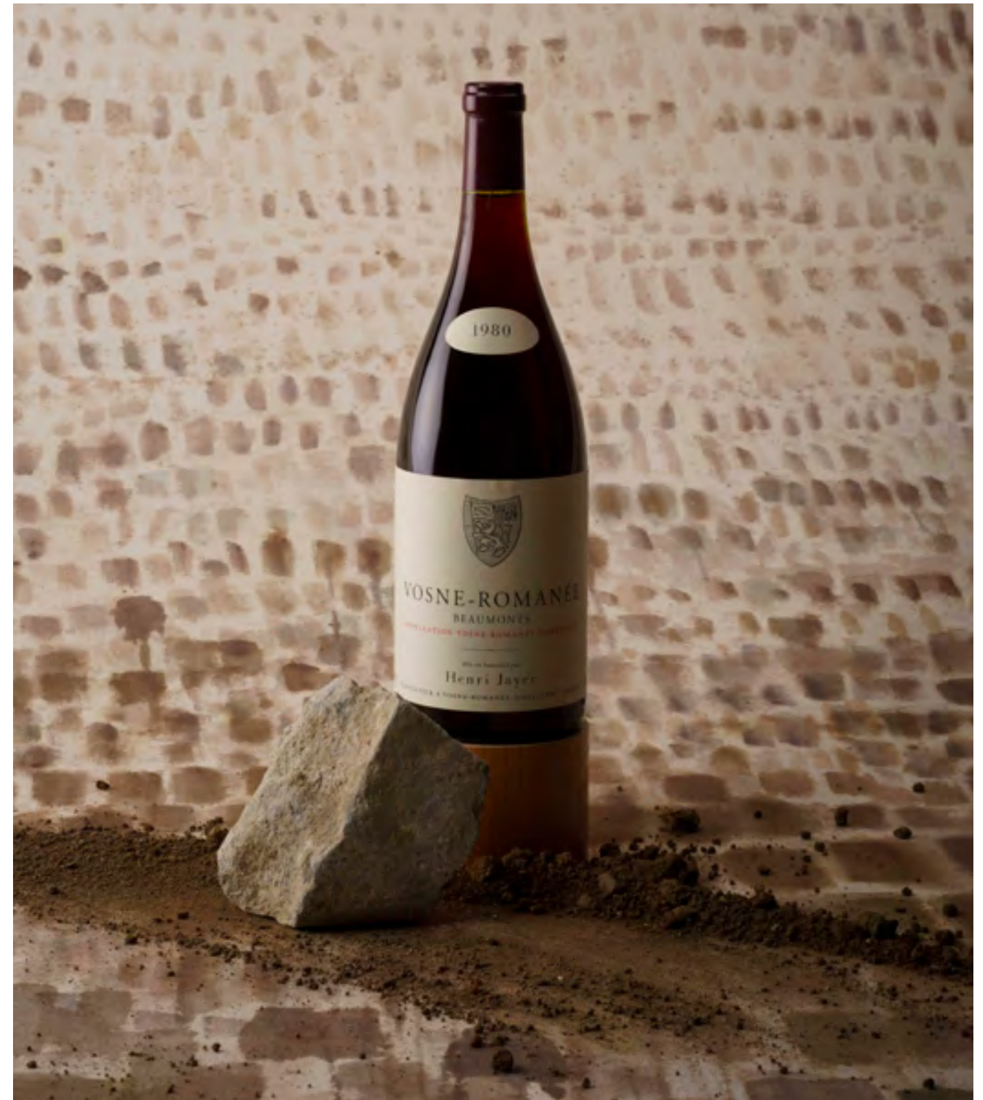
Photograph shows lot 114 – the photograph of lot 115 is available on our website