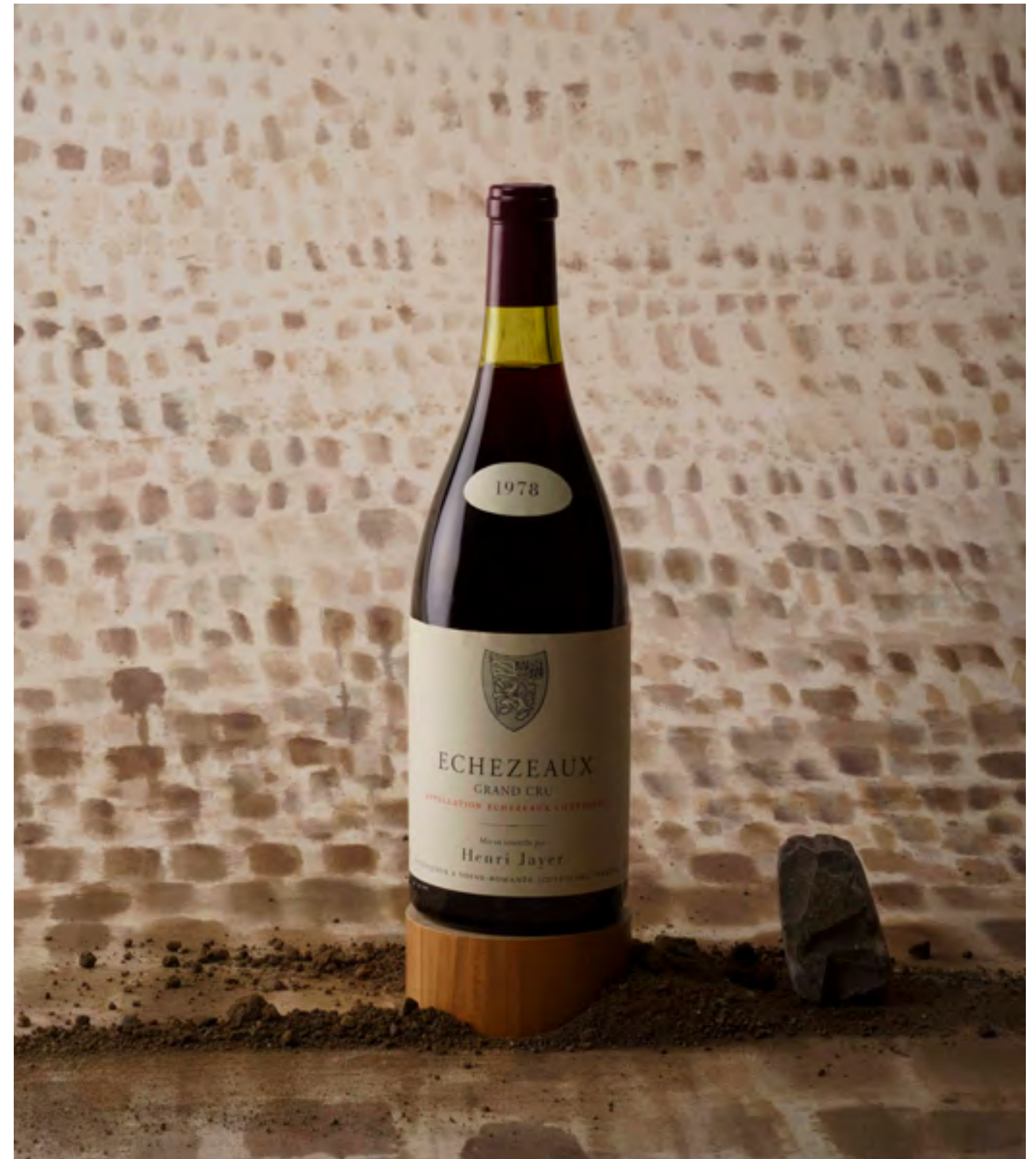
Photograph shows lot 142 – the photograph of lot 143 is available on our website