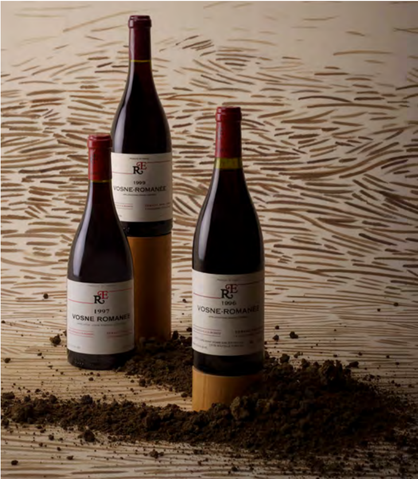
Photograph shows lot 36 – the photograph of lot 37 is available on our website

Vintage 1999 Good appearance and level Slightly marked label 1 Bottle