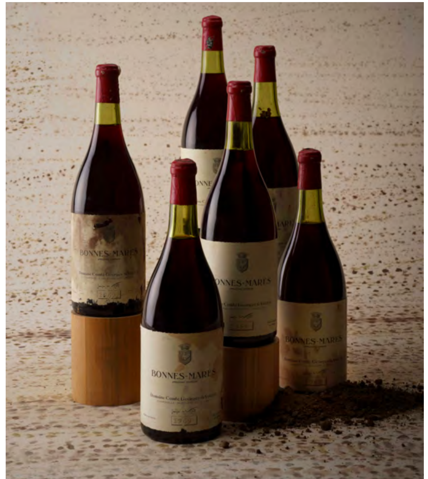
Photograph shows lot 80 – the photograph of lot 81 is available on our website

lot 81 Three very slightly nicked capsules Two slightly stained labels, one stained and one very damp-stained Three are slightly nicked and one slightly torn Levels: two at 6,5cms, two at 7cms and two at 7,5cms below base of capsules 6 Magnums per lot CHF 12'000 – 24'000 per lot