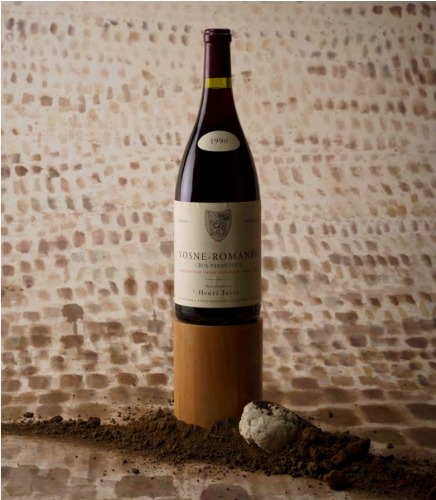
Photograph shows lot 128 – the photographs of lots 127 and 129 are available on our website

lot 129 Excellent appearance Level at 2,9cms below base of capsule 1 Magnum per lot CHF 30'000 – 60'000 per lot