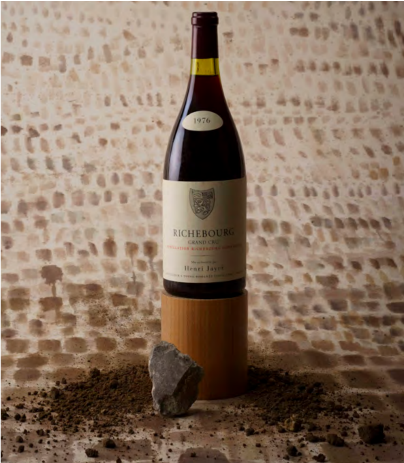
Photograph shows lot 155 – the photograph of lot 156 is available on our website