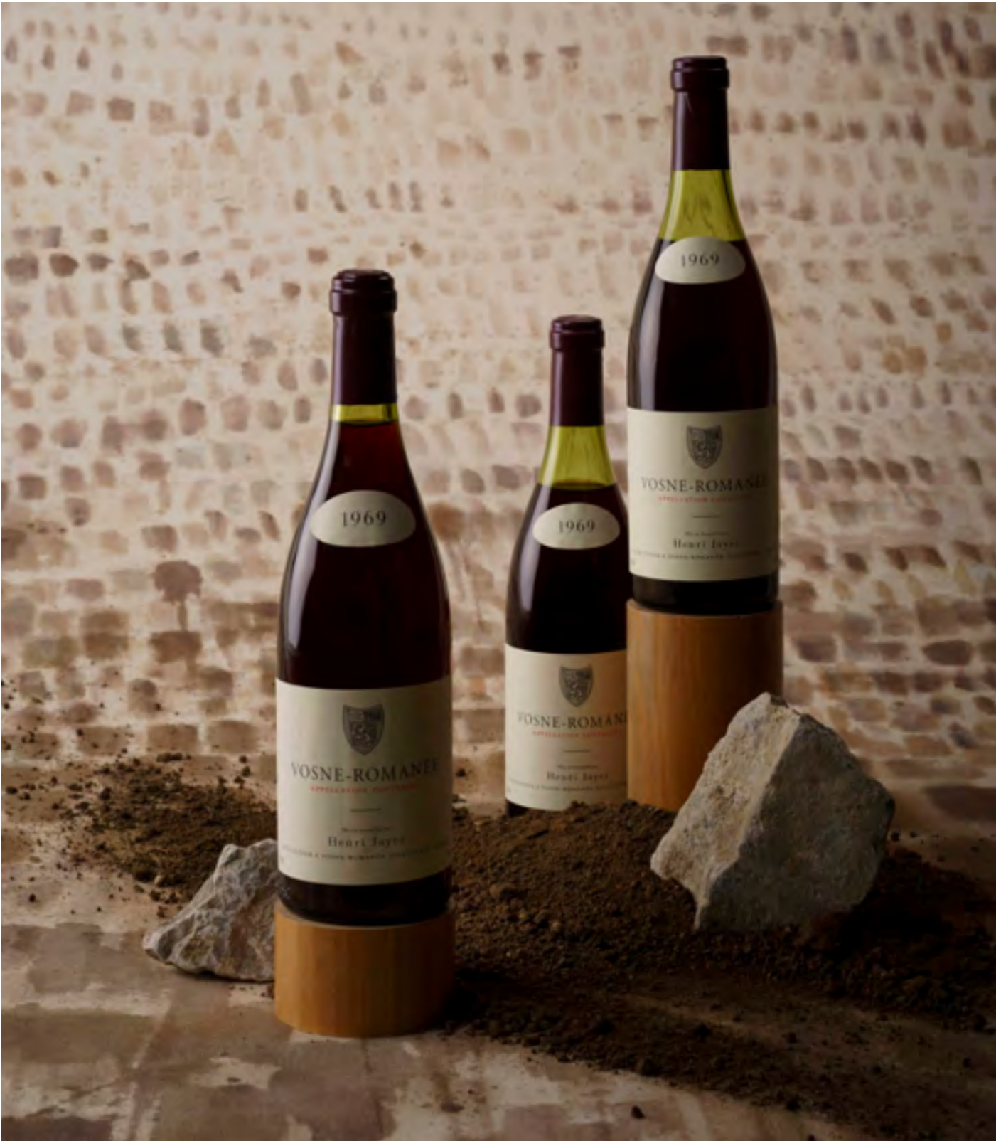
Photograph shows lot 104 – the photograph of lot 105 is available on our website