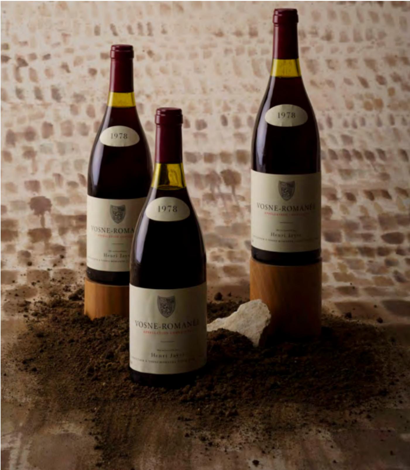
Photograph shows lot 107 – the photograph of lot 108 is available on our website

lot 108 Excellent appearance Levels: two at 3,4cms and one at 4,2cms below base of capsules 3 Bottles per lot CHF 15'000 – 30'000 per lot