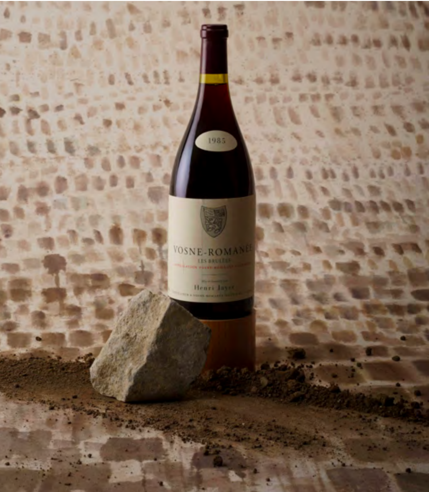
Photograph shows lot 120 – the photograph of lot 121 is available on our website