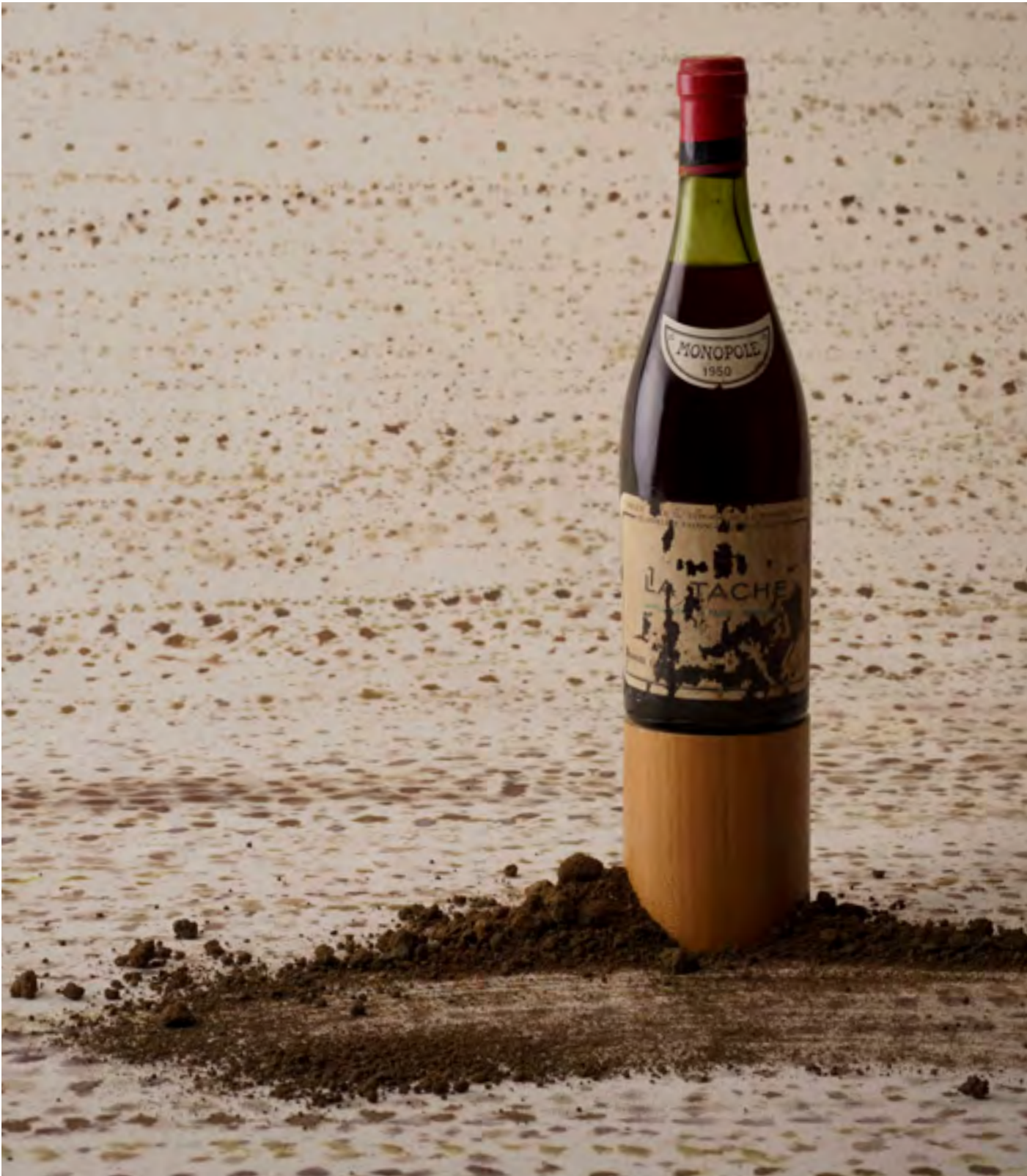
Photograph shows lot 65 – the photographs of lots 66 and 67 are available on our website

lot 67 One stained label and one torn and damaged One illegible vintage slip Levels at 5cms below base of capsules 2 Bottles per lot CHF 3'000 – 6'000 per lot