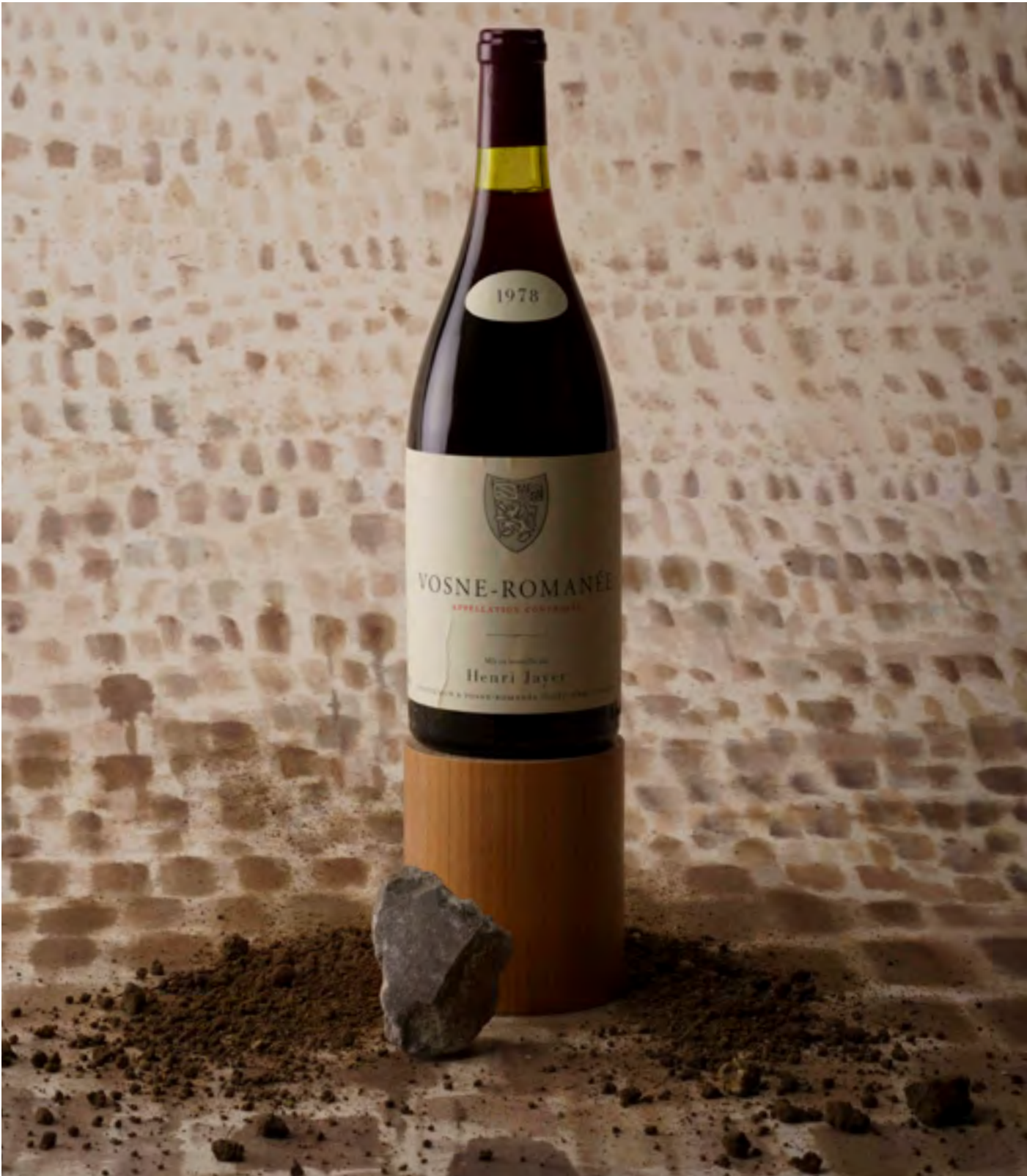
Photograph shows lot 102 – the photograph of lot 103 is available on our website

lot 103 Excellent appearance Level at 2,3cms below base of capsule 1 Magnum per lot CHF 13'000 – 26'000 per lot