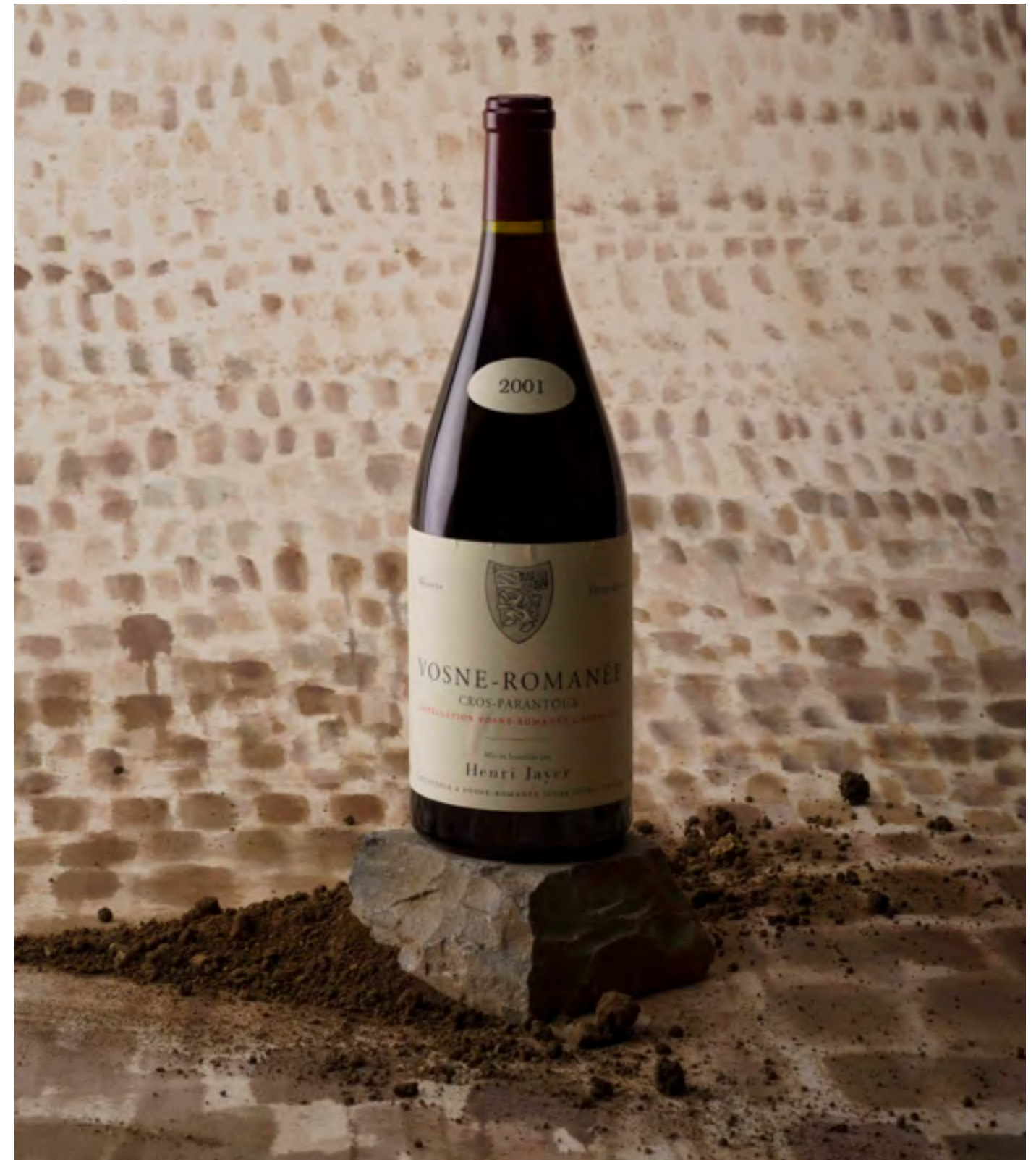
Photograph shows lot 131 – the photographs of lots 130 and 132 are available on our website

lot 132 Excellent appearance Excellent levels for the age 6 Magnums per lot CHF 180'000 – 360'000 per lot