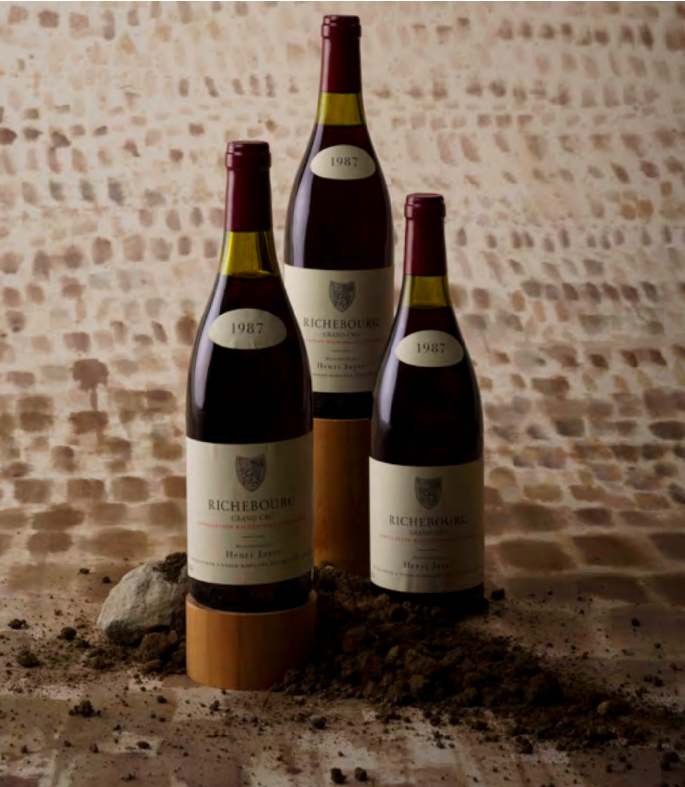
Photograph shows lot 167 – the photograph of lot 168 is available on our website