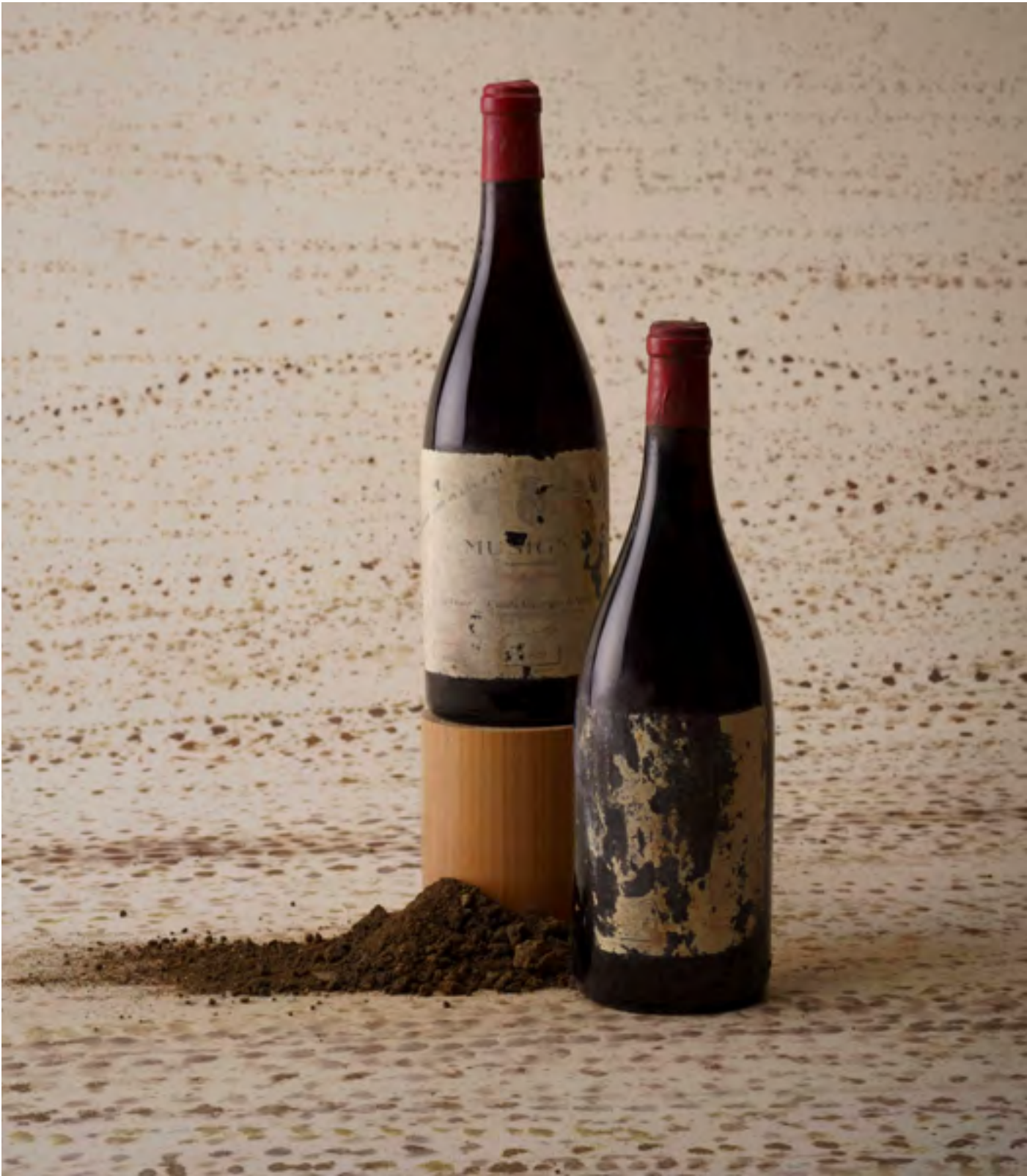
Photograph shows lot 76 – the photograph of lot 77 is available on our website

lot 77 One very damaged capsule on the top with old signs of seepage Bin-soiled and torn labels Levels: one at 8cms and one at 9,5cms below base of capsules 2 Magnums per lot CHF 3'000 – 6'000 per lot