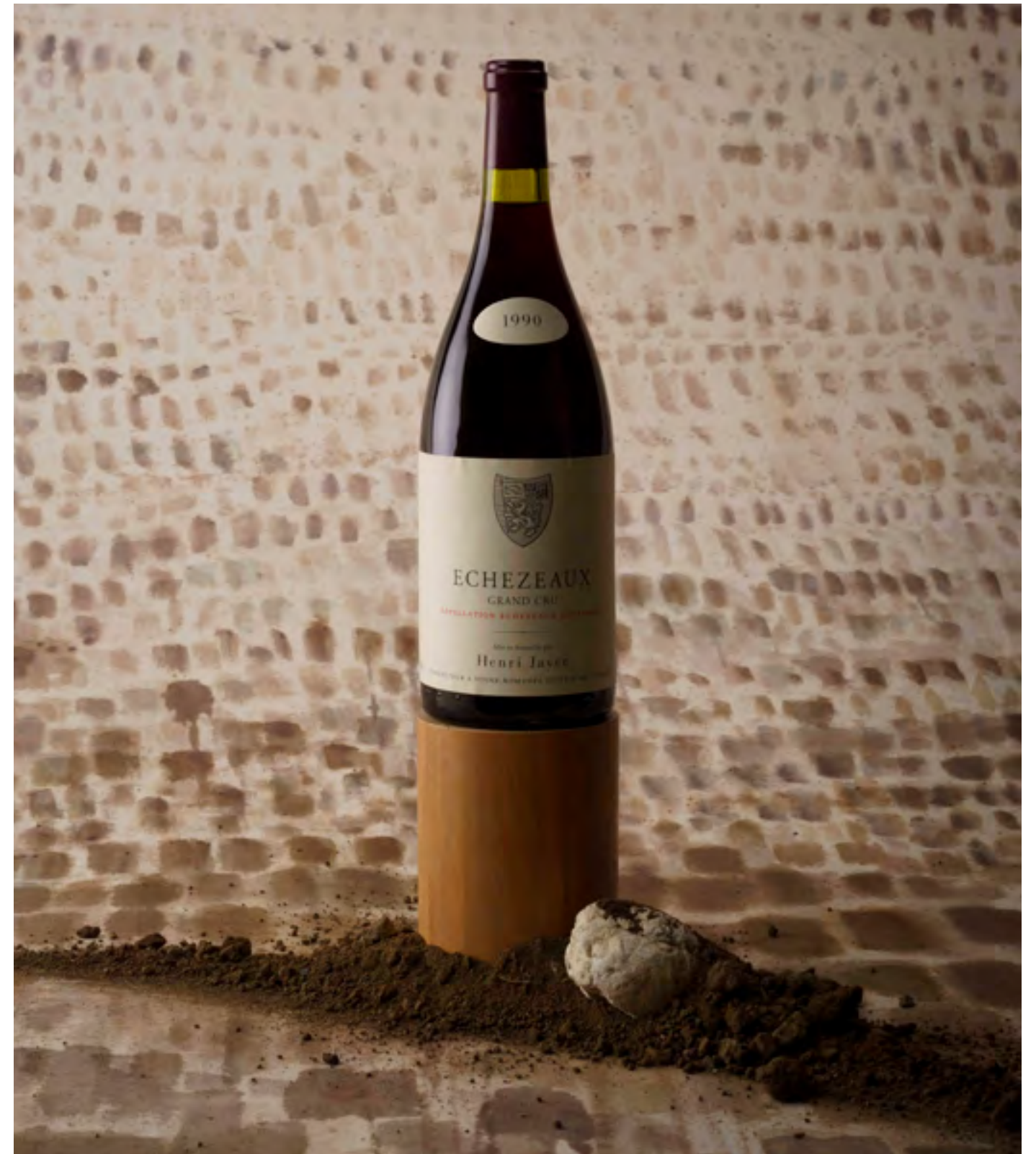
Photograph shows lot 146 – the photograph of lot 147 is available on our website