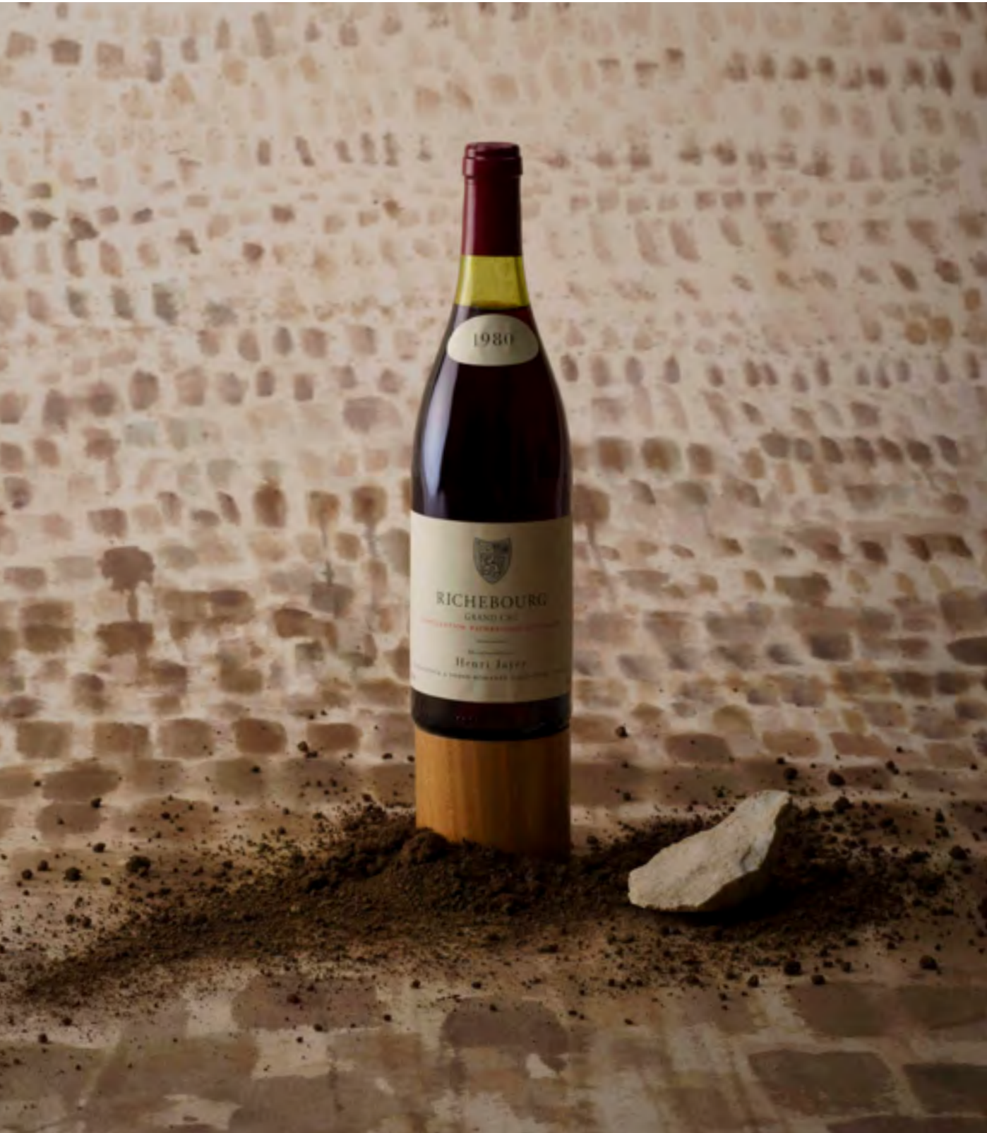
Photograph shows lot 164 – the photograph of lot 165 is available on our website