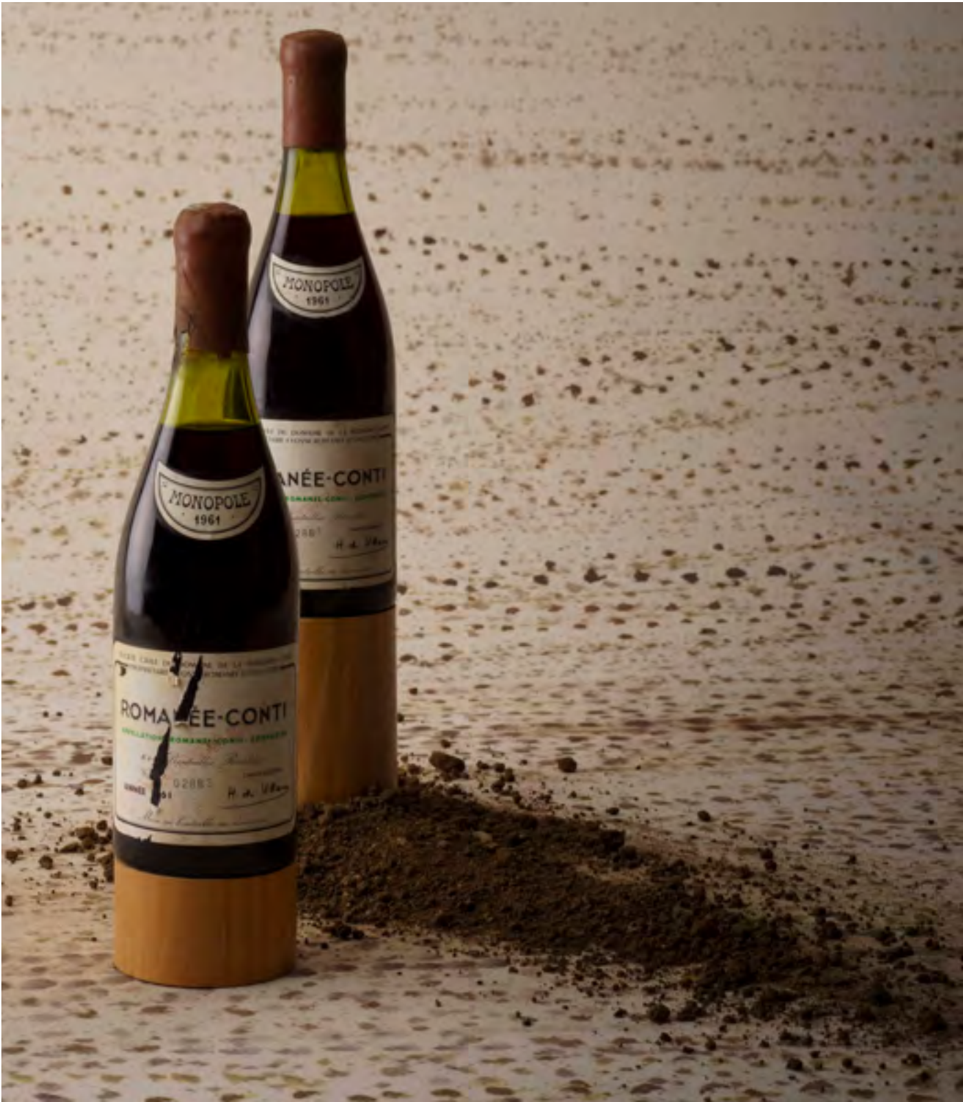
Photograph shows lot 61 – the photographs of lots 62, 63 and 64 are available on our website

lot 62 lot 64 Slightly cracked wax capsules One very damaged wax capsule and one with missing part of wax capsule One slightly marked label Slightly marked labels Levels at 4,3cms below base of wax capsules Levels: one at 6cms and one at 6,5cms below base of wax capsules 2 Bottles per lot 2 Bottles per lot CHF 17'000 – 34'000 per lot CHF 13'000 – 26'000 per lot