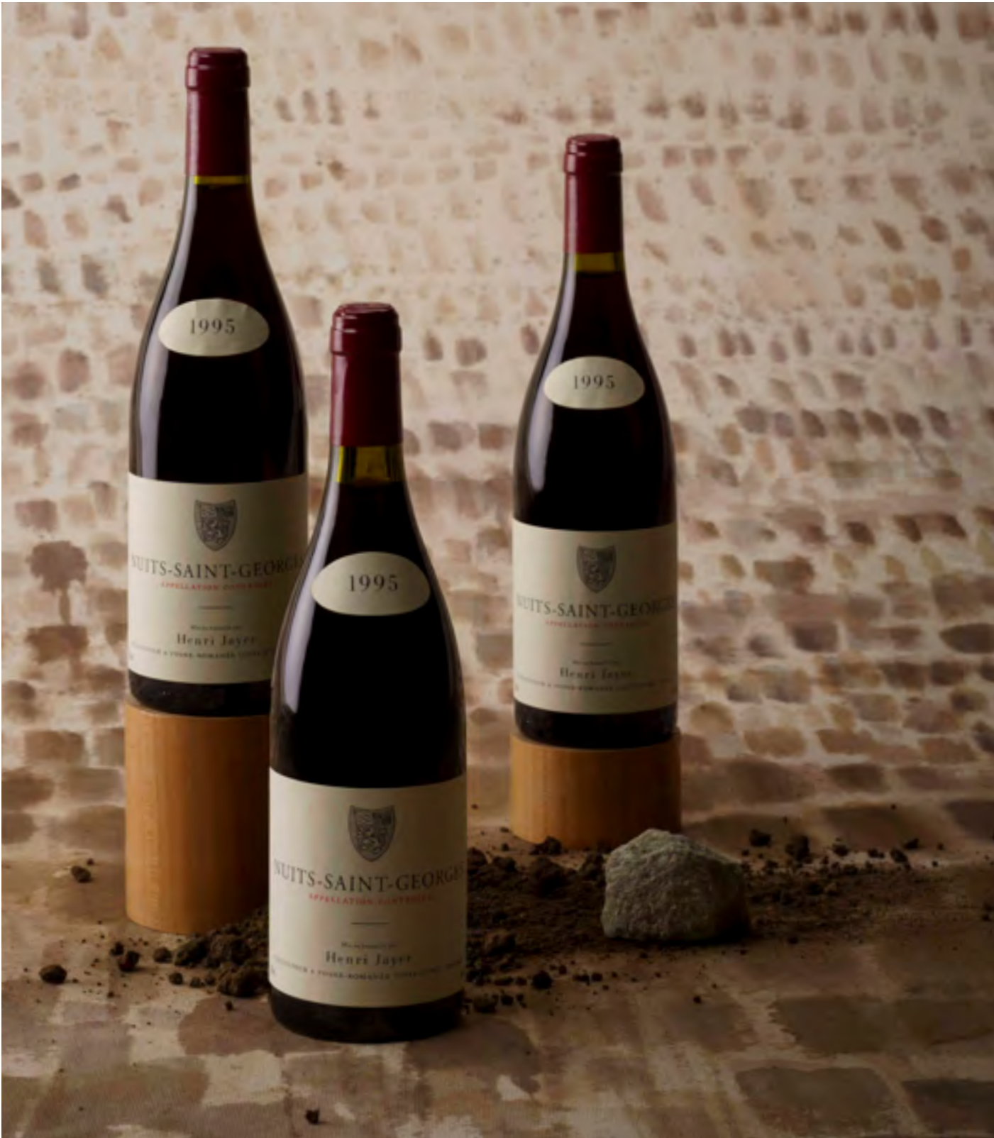
Photograph shows lot 92 – the photograph of lot 93 is available on our website

lot 92 Excellent appearance Excellent levels for the age 3 Bottles per lot CHF 10'000 – 20'000 per lot lot 93 Excellent appearance Levels: two at 2,5cms and one at 2,7cms below base of capsules 3 Bottles per lot CHF 10'000 – 20'000 per lot