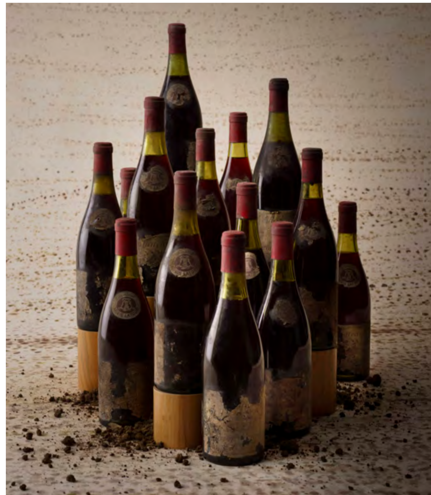
Photograph shows part of lot 83 – all photographs of lot 83 are available on our website

Nuits les Vaucrains Vintage 1957 — P. Misserey Burgundy, Côte de Nuits Confrérie des Chevaliers du Tastevin label Good appearance Levels: one at 3cms, one at 3,5cms, one at 4cms and one at 4,5cms below base of capsules 4 Bottles