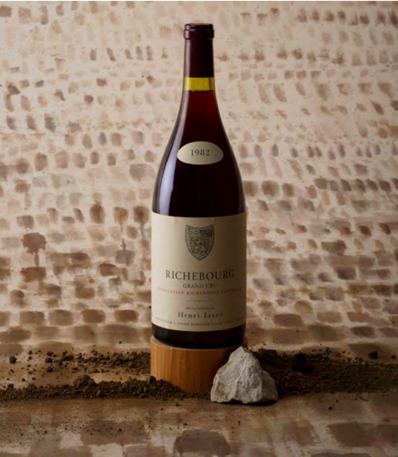
Photograph shows lot 158 – the photograph of lot 159 is available on our website