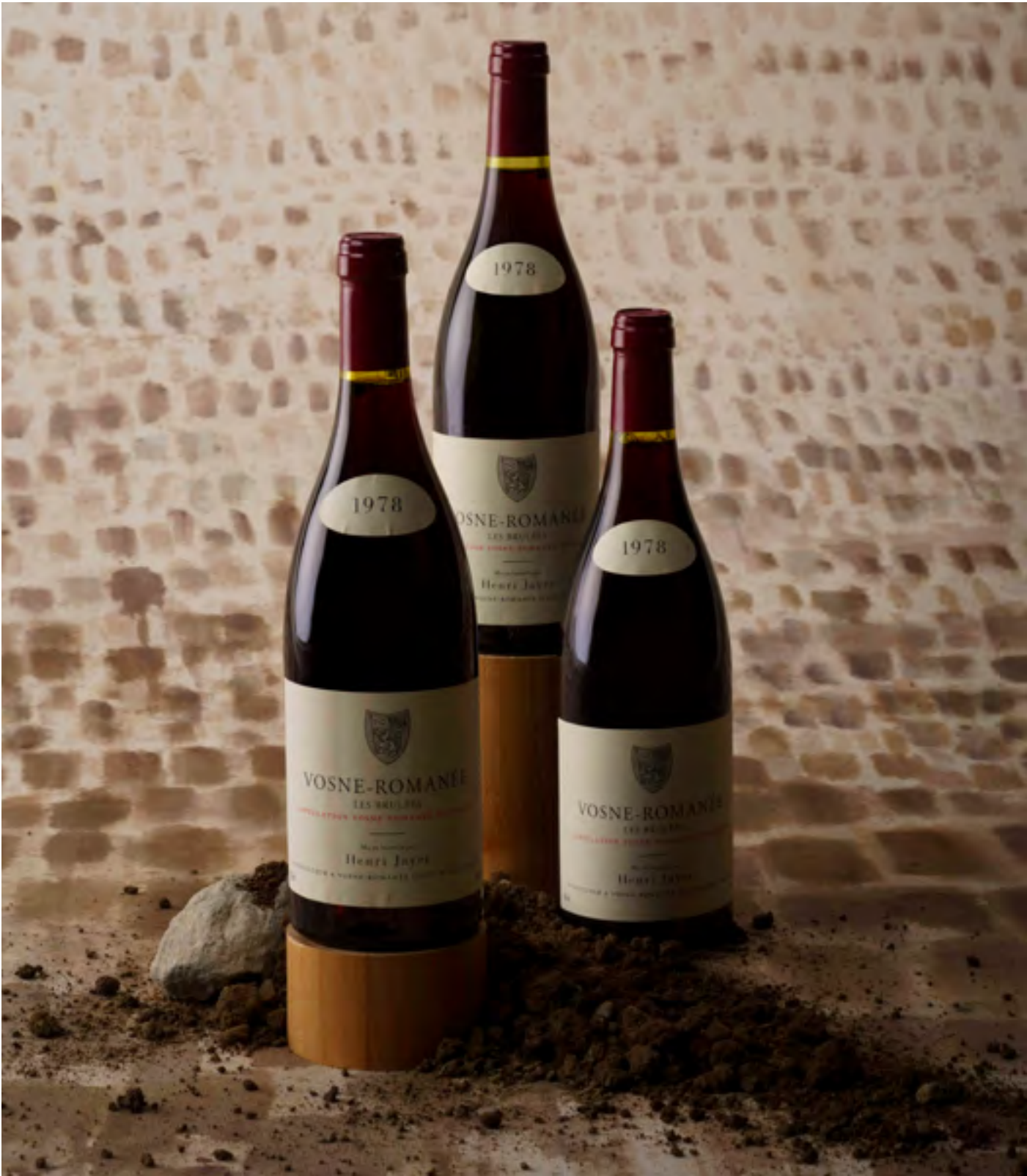
Photograph shows lot 124 – the photograph of lot 125 is available on our website

lot 125 Excellent appearance Levels: one at 1,5cms, one at 2,8cms and one at 5,4cms below base of capsules 3 Bottles per lot CHF 20'000 – 40'000 per lot