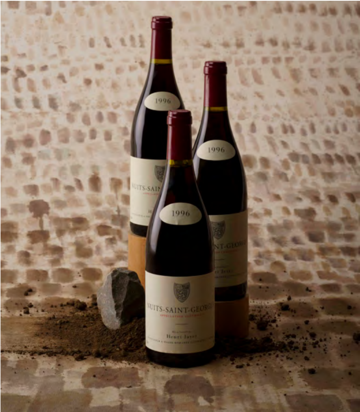
Photograph shows lot 94 – the photograph of lot 95 is available on our website

lot 95 Excellent appearance Excellent levels for the age 3 Bottles per lot CHF 10'000 – 20'000 per lot